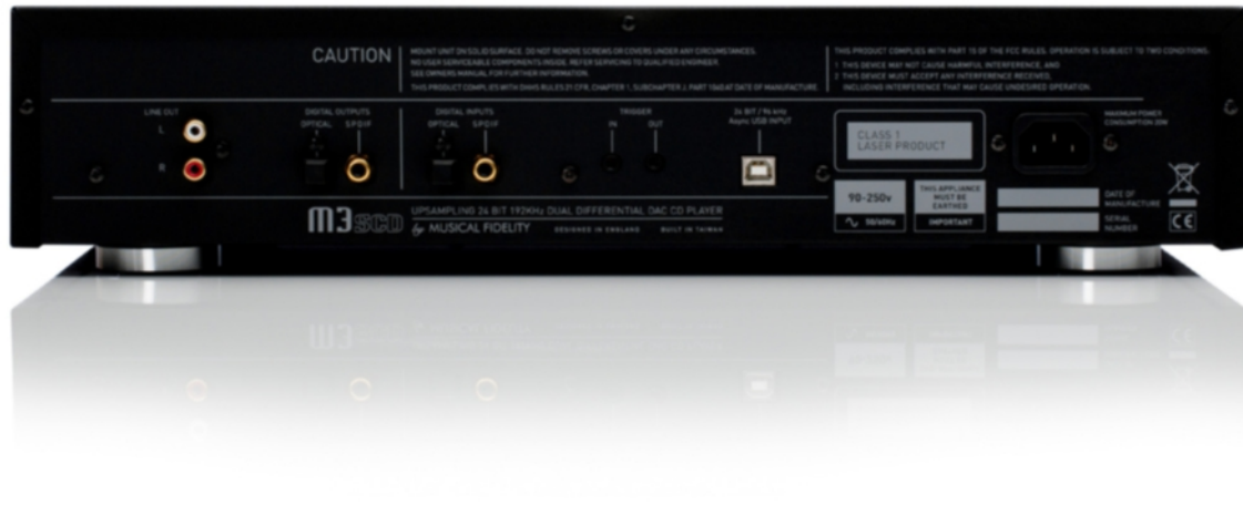
M3sacd – CD PLAYER