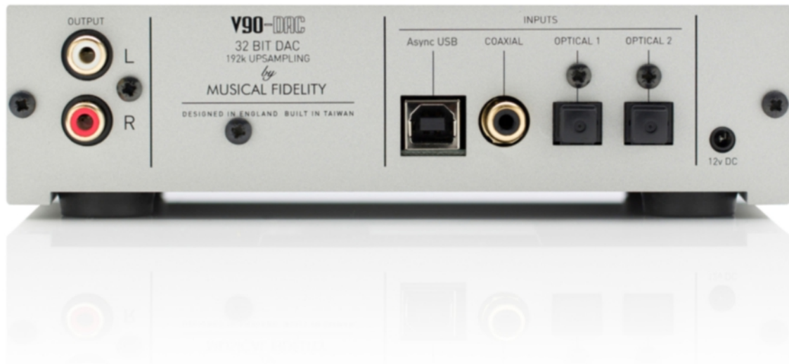
V90-DAC DIGITAL TO ANALOGUE CONVERTER