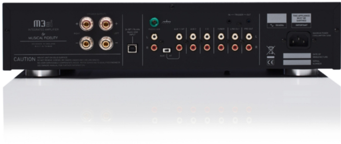
M3si INTEGRATED AMPLIFIER