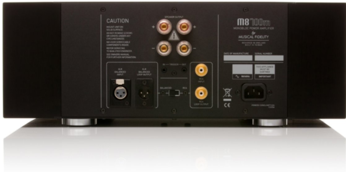
M8-700m MONOBLOC POWER AMPLIFIER