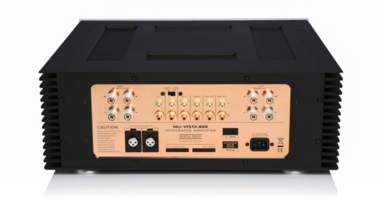
NU-VISTA 800 INTEGRATED AMPLIFIER