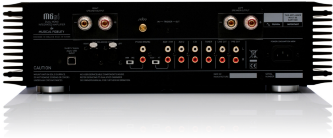
M6si INTEGRATED AMPLIFIER