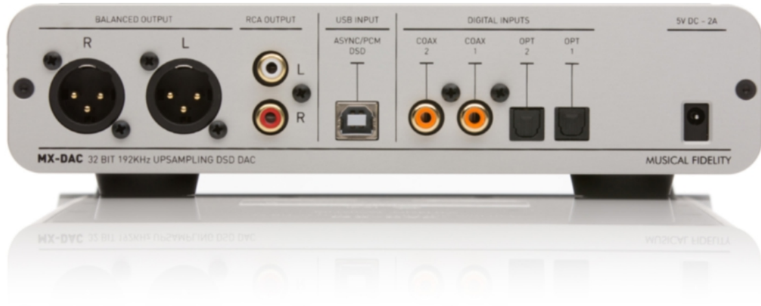
MX-DAC Digital-to-Analogue Converter with DSD