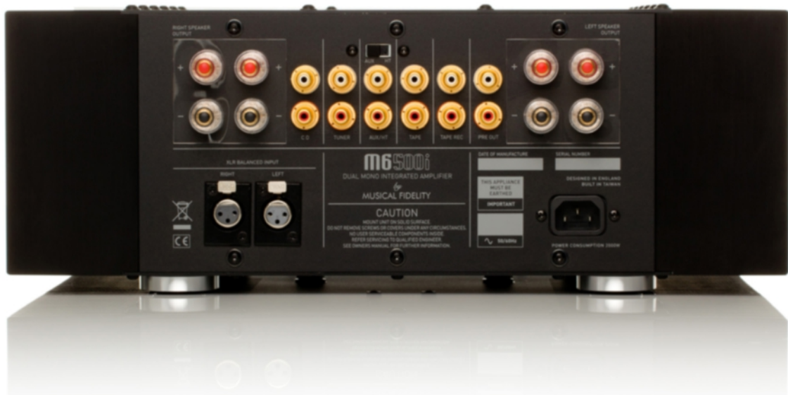
M6500i Integrated Amplifier