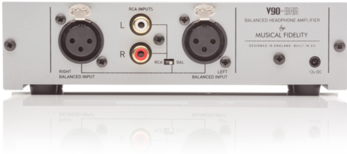
V90-BHA BALANCED HEADPHONE AMPLIFIER