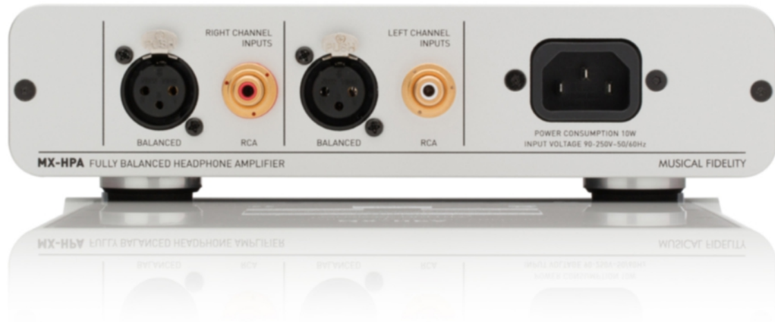
MX-HPA BALANCED HEADPHONE AMPLIFIER