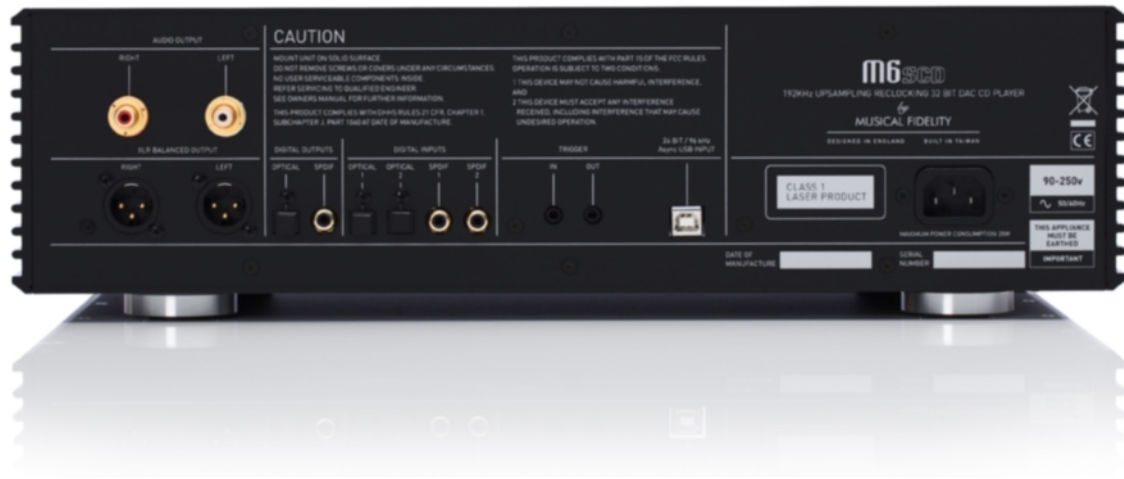
M6sCD CD PLAYER