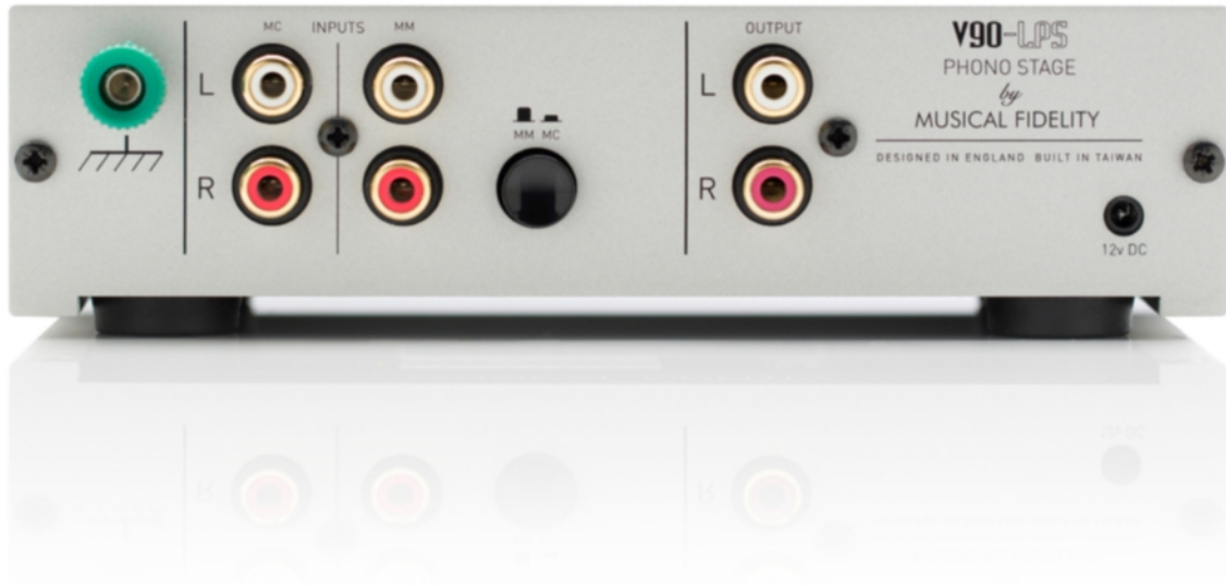
V90-LPS PHONO STAGE