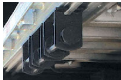
■ 3-Bar Winches make load securement fast and easy.