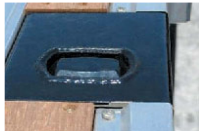
■ Twist Locks can be incorporated into the design for securement of containers atop the flatbed.