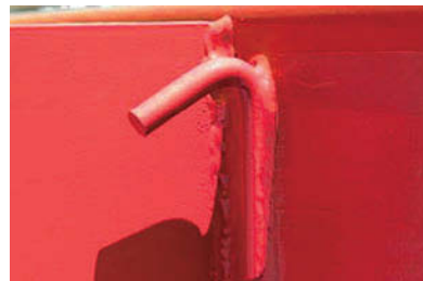
■ Rope Ties can be located on the side rail as well as on the front and rear crossmembers.