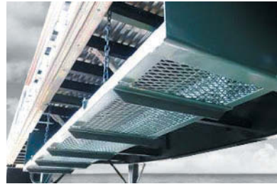
■ Dunnage Rack