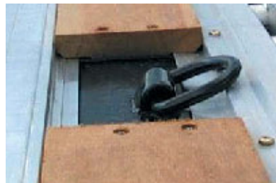
■ D Rings are recessed below the floor level.