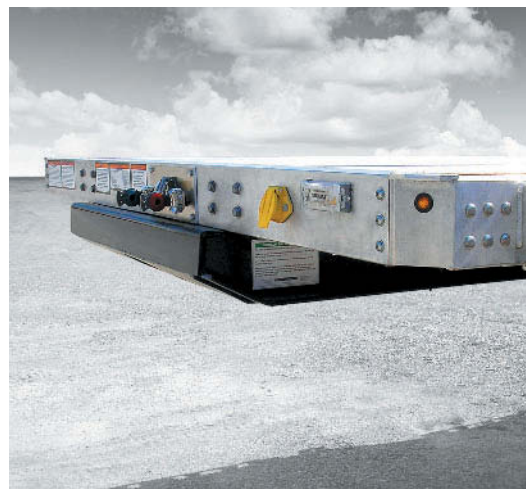
■ Aluminum Front Crossmember is secured with a fatigue-resistant bolted attachment.

The Freedom LT can be outfitted with these popular options: