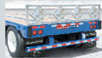
■ Special Load Options