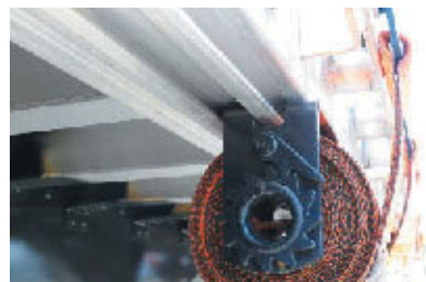
■ Aluminum Double L Winch Track