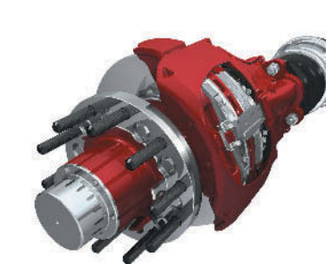
■ Air Disc Brakes offer reduced stopping distances when compared to drum brakes and help reduce stop brake fade. A variety of options are available.