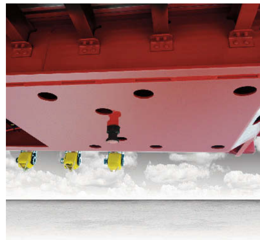
■ .38" Thick Upper Coupler fifth-wheel plate provides greater strength and corrosion protection.