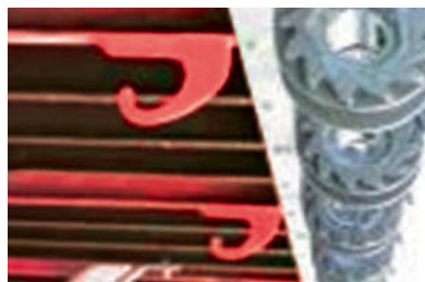
■ C Hooks are located on the underside of the trailer.