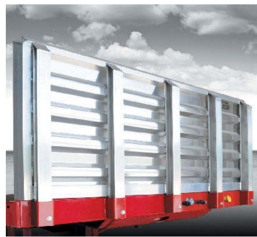
■ Factory-Installed D.O.T Rated Aluminum Bulkheads add strength and security for your driver and the load.