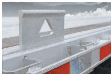
■ Sliding Chain Hooks & Tracks allow for the use of chains and binders anywhere along the length of the side rail.