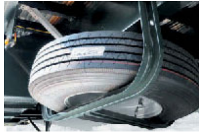
■ Tire Carriers