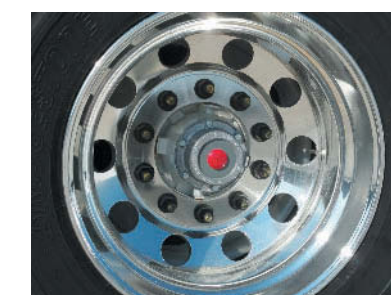
■ Wheel Options A variety of wheel selections to help achieve added payload and fuel savings are available. • Aluminum Wheels • Wide-Base Steel Wheels • Wide-Base Aluminum Wheels