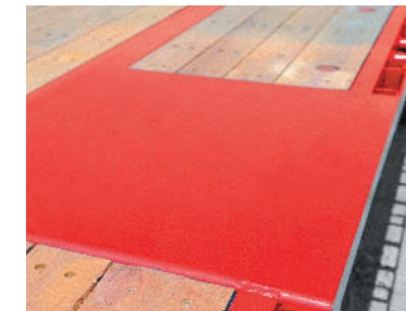
■ Floor Pans For deep drop configurations floor pans are located above the tires allow for maximum tire clearance.