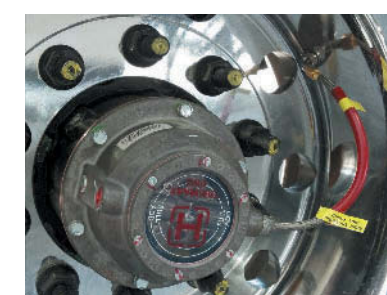
■ Automatic Tire Inflation Systems help extend tire life and increase fuel efficiency by using compressed air from the tractor to maintain tire pressure settings during operation. Multiple tire inflation systems are available as options.