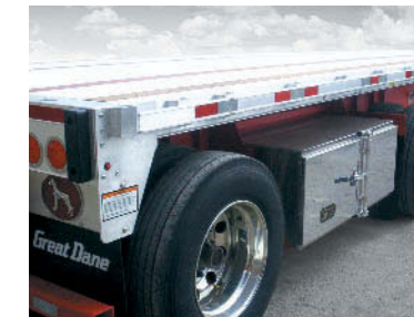
■ Full-length Rub Rail