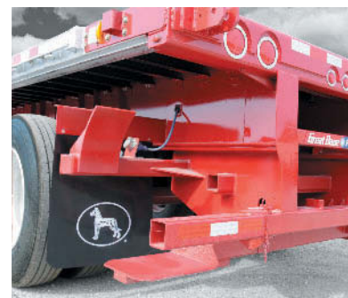
■ Piggyback Forklift Options