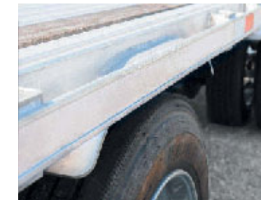
■ Continuous Rail Wheel Pan