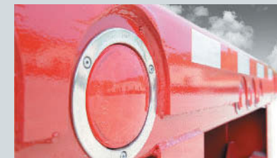
■ Custom Paint