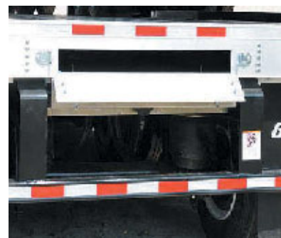
■ Rear Dunnage Rack