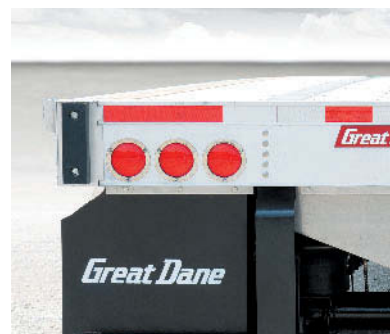
■ 6-Lamp Buckplate