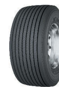
■ Tire Options Optional tire brands are available in dual- and wide-base styles. EPA SmartWay®-verified and CARB compliant brand options also available.