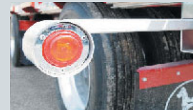
■ Options for Canada