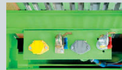
■ Air & Electrical Locations