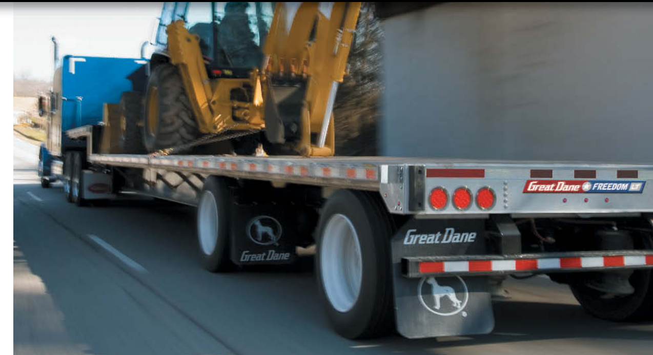
■ Drop Deck Option offers lower deck heights for tall or heavy-duty hauling. Standard upper coupler height is 48" with an 18" king pin location. Drop depth from the upper deck is 20" with a rear deck height of 40". Reinforcing doubler plates in critical stress areas like crossmember punches and upper to lower transition area increase durability. Widespread configurations are further supported by reinforcing gussets in the suspension area.