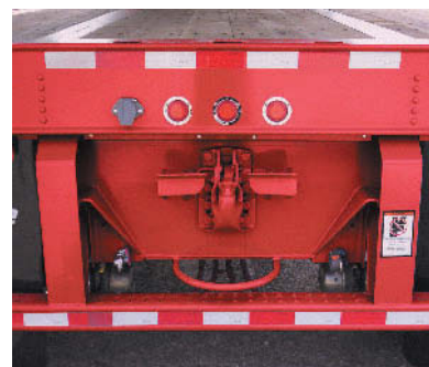
■ Pintle Hook