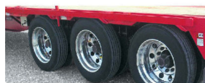
■ Tridem Axle/Suspension Package is available for operations where weight laws permit added payload through weight distribution. Options include spring or air-ride, fixed or slide, and standard-duty or heavy-duty options.