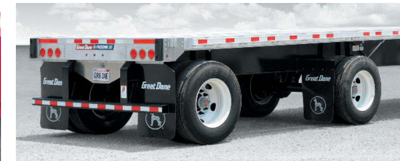
■ Widespread Tandem Package allows for an increase of the allowable legal weight per trailer axle, providing flexibility of load placement and the potential for higher cargo loads.