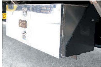
■ Tool Boxes