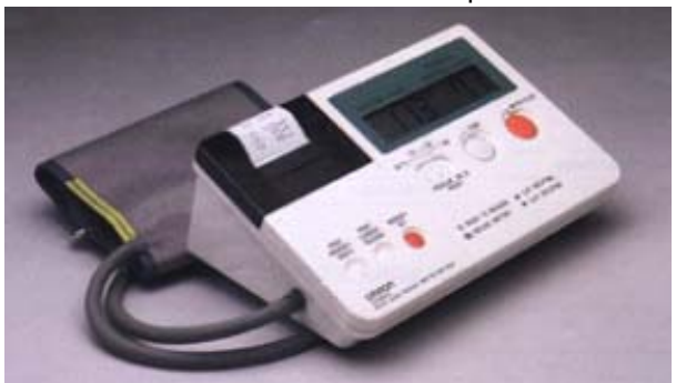
HEM - 705CP Unit Price: $139.95