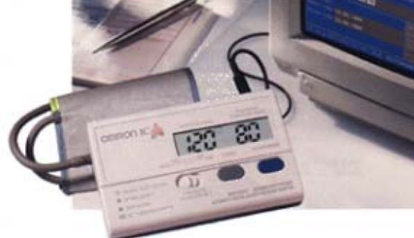
HEM - 725 CIC Unit Price: $350.00