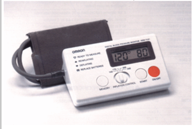
HEM - 712C Unit Price: $69.95

(See Below For Details on Selected Models)