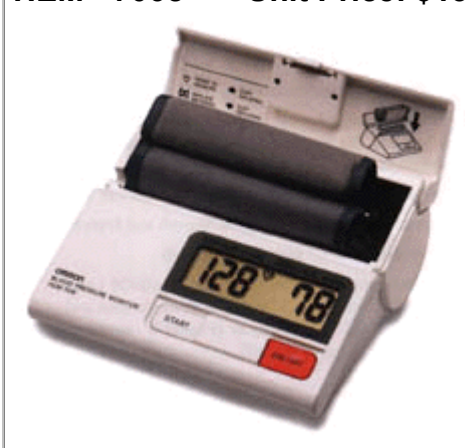
HEM - 706c Unit Price: $139.95