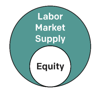
Fig. 1 Equity, Mobility, and Job Quality for Workers

The ECJ approach prioritizes supply side work that focuses explicitly on creating greater equity for the people of California. The economy generates inequality on multiple axes – race, gender, ethnicity, and ability, to name just a few. The California Workforce Development Board supports and invests in partnerships that help workers who have been disadvantaged close the gap. Equity means systematically generating greater opportunity for those who have been too long excluded. What does equity look like? Systems and organizations that support under-served or justice-involved or low-income Californians with training and mentoring to secure family supporting jobs; preapprenticeship or contextualized training that reaches out to immigrants and supports learning English alongside vocational skills; training and education programs for incumbent workers at the entry level to move to more skilled positions, and much more.