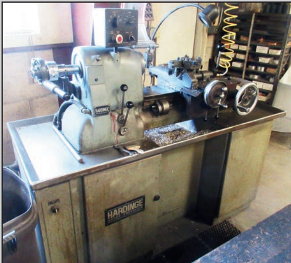
HARDINGE HC TOOLROOM LATHE