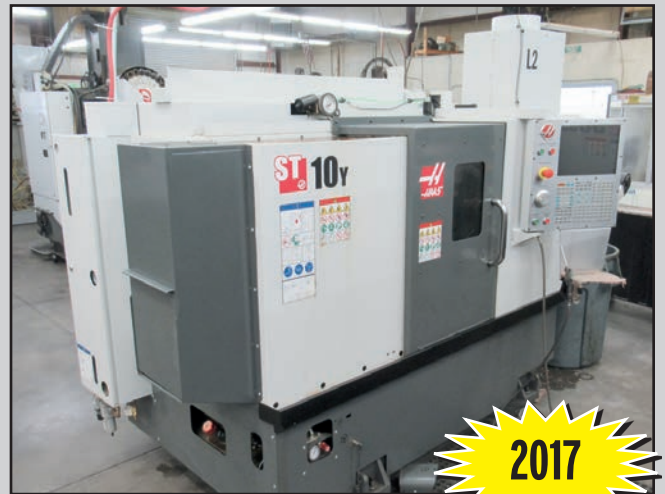
HAAS ST-10Y CNC LATHE

TAKISAWA Mdl. EX106 CNC Turning Center, 1.63" max. bar capacity, 9.5" max. turning diameter, 17.91" max. machining length, 13.75" max. swing, 6" chuck, 5,000 RPM max. spindle speed, 10 HP spindle drive, Fanuc 2i-T CNC control.