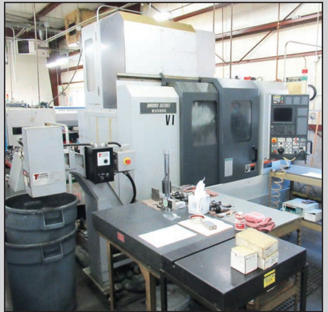
MORI SEIKI MV5000A/40 3-AXIS CNC VERTICAL MACHINING CENTER