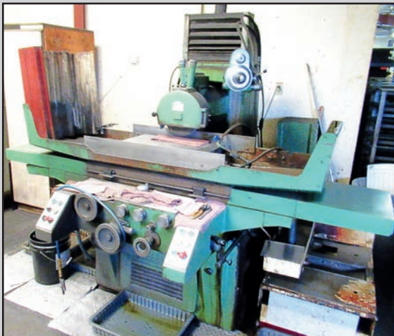
JAKOBSEN SJ-24 AUTOMATIC HYDRAULIC SURFACE GRINDER