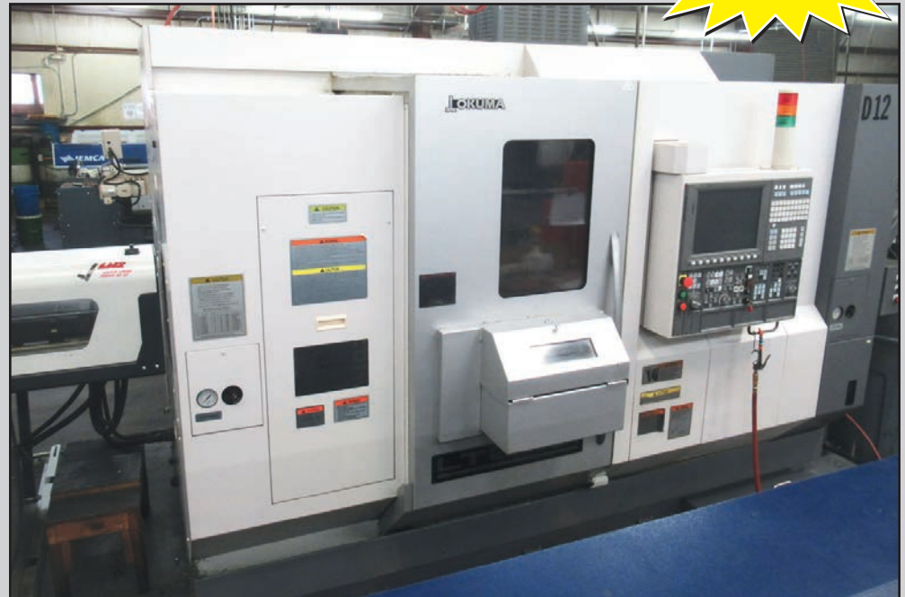
OKUMA LT200 EX CNC LATHE

Massive Selection of CNC Tool Holders, Machine Tool Accessories, Perishable Tooling, Tool Cabinets & Stock Racking, Plant & Office FF&E, and Much More!