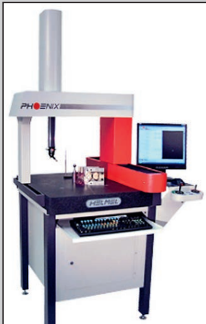
HELMEL PHOENIX CMM