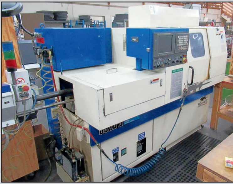
TSUGAMI BS20-II CNC SWISS STYLE SCREW MACHINE