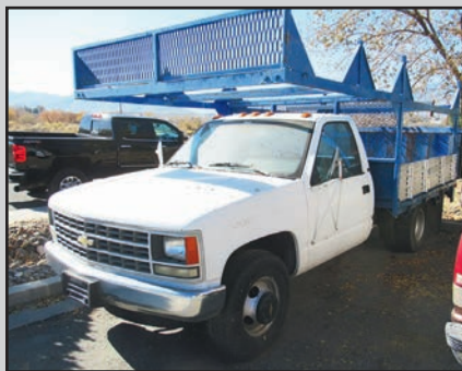
CHEVROLET C3500 STAKE BODY TRUCK WITH LIFT GATE