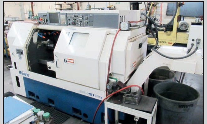
MIYANO BNJ-51SY2 5-AXIS TWIN TURRET CNC LATHE

TSUGAMI Mdl. BS18B-II CNC Swiss Type Automatic Screw Machine, 18mm max. machining range, 8,000 RPM max. spindle speed, 15-position spindle indexing, (7) OD tool stations, (3) front ID tool stations, (3) Back ID tool stations, 2-axis sub spindle, Iemca Mdl. Mini Boss 325 CNC/37 automatic bar feed, Royal filter master mist collector, Fanuc Mdl. LH1 CNC control.