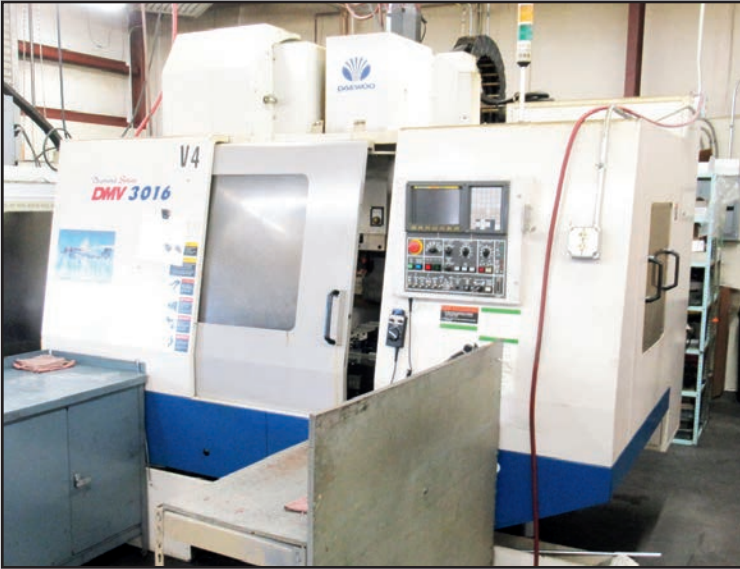
DAEWOO DMV 3016 CNC VERTICAL MACHINING CENTER