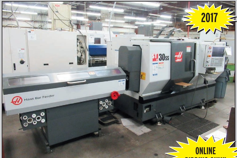
HAAS ST-30SS SUPER SPEED CNC LATHE