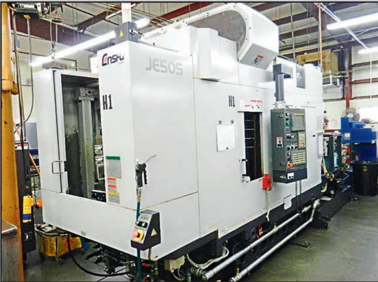
ENSHU CNC HORIZONTAL MACHINING CENTER