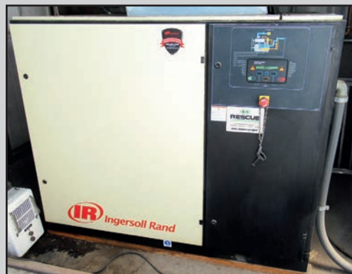
INGERSOLL RAND ROTARY SCREW AIR COMPRESSOR