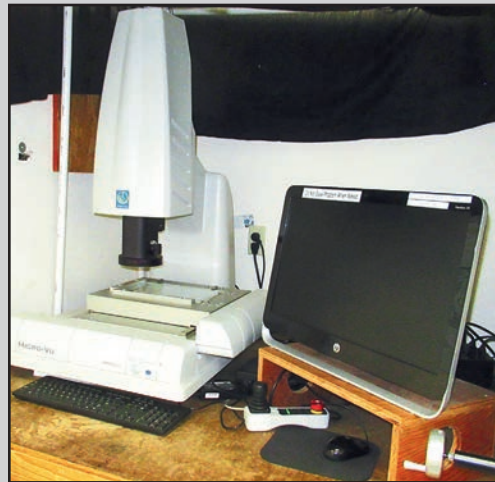
VERTEX 251 UC VIDEO INSPECTION SYSTEM