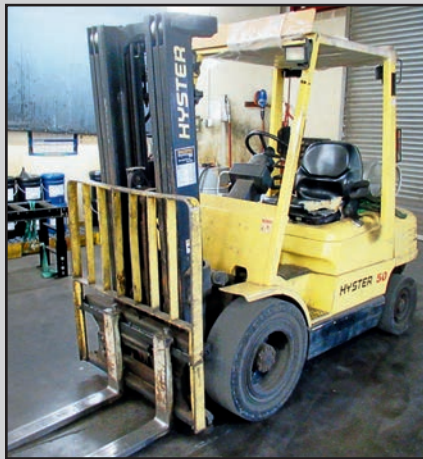
HYSTER SOLID TIRE LP FORKLIFT