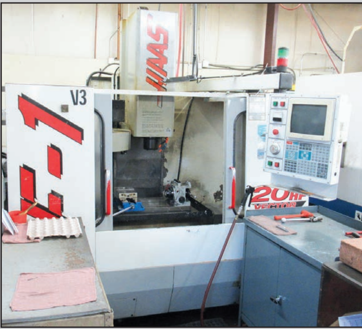
HAAS VF-1 4-AXIS CNC VERTICAL MACHINING CENTER