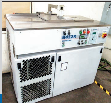
BRANSON ULTRASONIC VAPORIZING DEGREASER