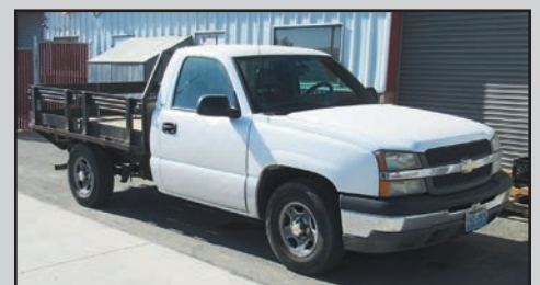
CHEVROLET 8' STAKE BODY TRUCK

CHEVROLET C3500 10' Stake Body Truck , with headache rack, hydraulic lift gate.