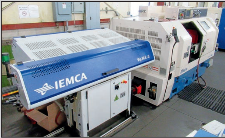
(1 OF 2) MIYANO BJ-42SY 5-AXIS TWIN TURRET CNC TURNING CENTERS