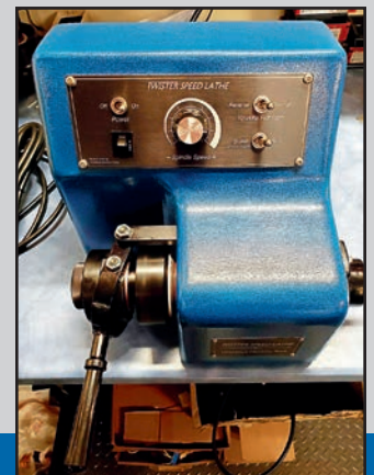
TWISTER SPEED LATHE

DATE: Online Only Bidding Closes Tuesday, March 9th at 10:00 A.M. PST