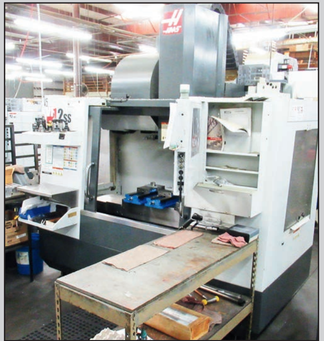
HAAS VF-2SS CNC VERTICAL MACHINING CENTER