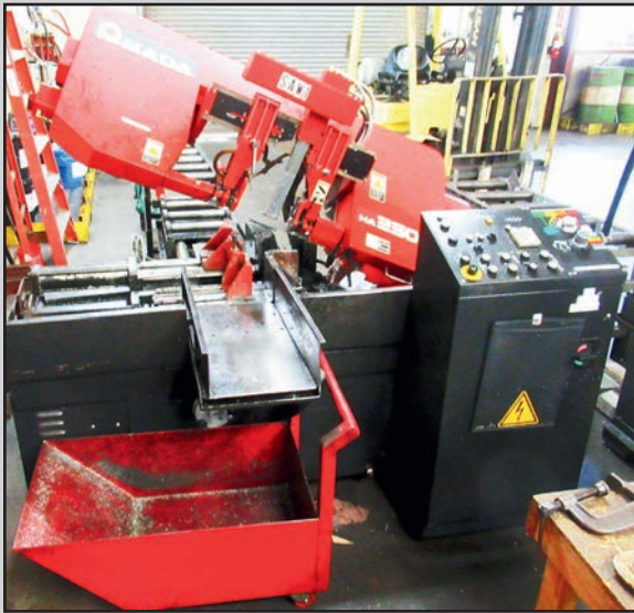
(1 OF 2) AMADA HA250W AUTOMATIC HORIZONTAL BAND SAWS

Extensive Selection of DE Pedestal Grinders, Drill Presses, Tool and Cutter Grinders, Drill Point Grinders, Pneumatic and Power Hand Tools, Welders, Machine Tool Accessories, and All Related.