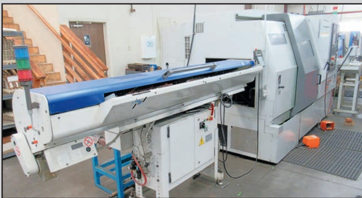
(1 OF 2) MORI SEIKI ZL-153SMC TWIN TURRET CNC TURNING CENTERS