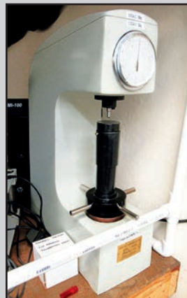
ROCKWELL HARDNESS TESTER