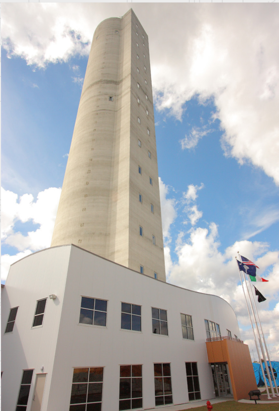
Abbeville, SC Plant