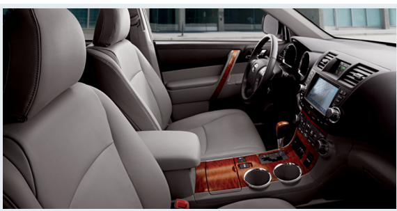
Limited shown in Ash leather trim with available Extra Value Package #2