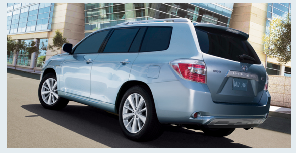
Highlander Hybrid shown in Wave Line Pearl with available Extra Value Package #2 and accessory roof rail cross bars