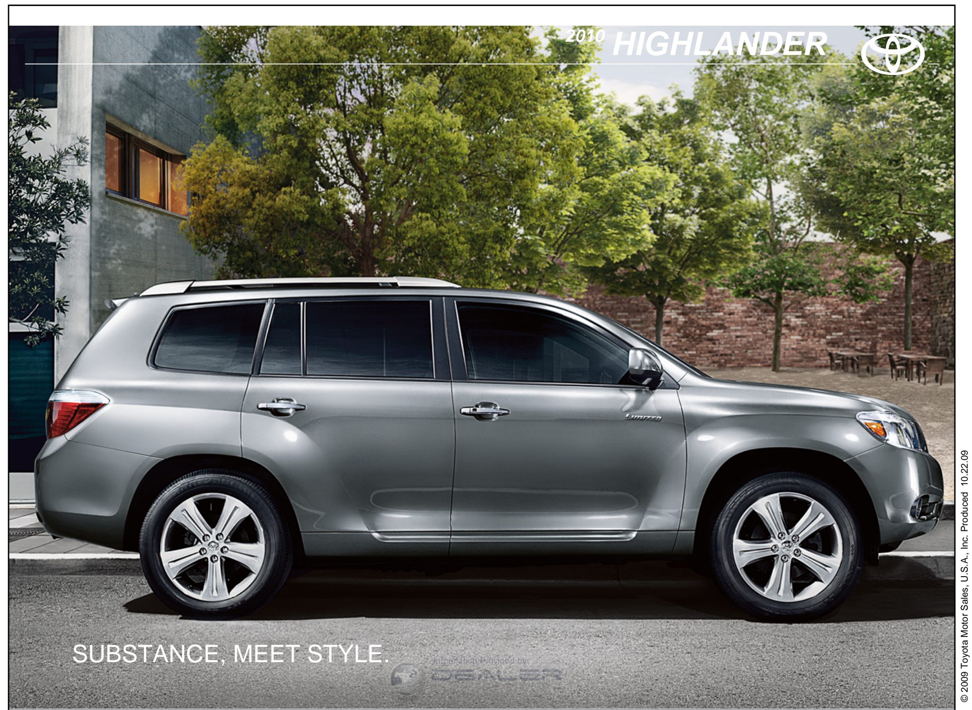
PAGE 1 of 21