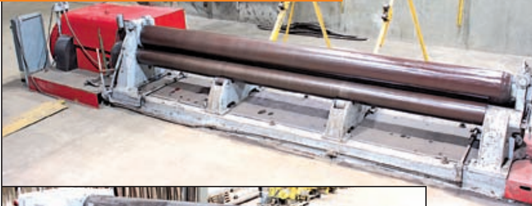
PLATE BENDING & ANGLE ROLLS

Information contained herein deemed to be accurate at time of printing and subject to change. For updated information, please visit our website at www.hilcoind.com for any changes to date, sale process, terms and conditions and list of available assets.