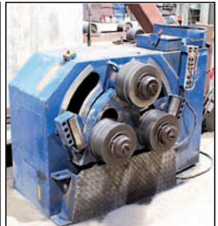
PLATE BENDING & ANGLE ROLLS