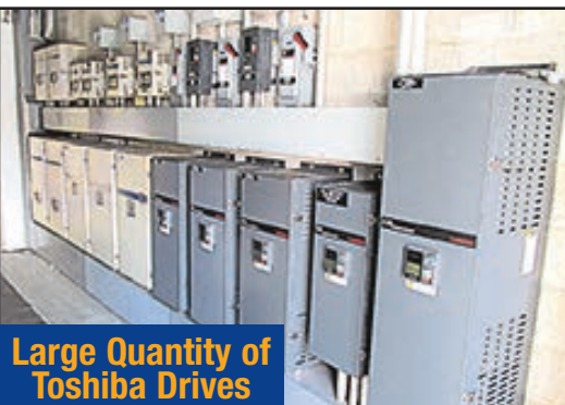
Large Quantity of Toshiba Drives