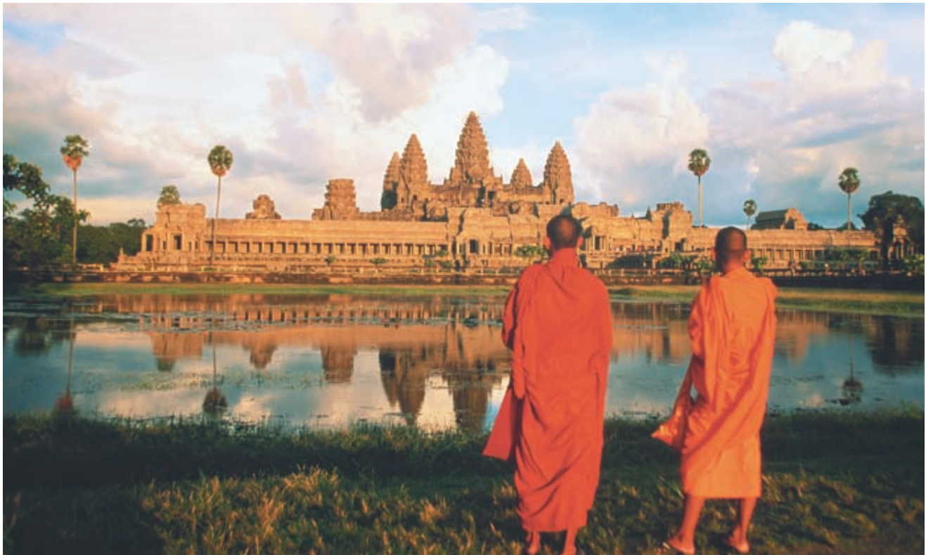
▲ Buddhist monks view a temple at Angkor Wat in Cambodia.

The Religious Community The five disciples who heard the Buddha’s first sermon were the first monks admitted to the sangha , or Buddhist religious order. At first, the sangha was a community of Buddhist monks and nuns. However, sangha eventually referred to the entire religious community. It included Buddhist laity (those who hadn’t devoted their entire life to religion). The religious community, together with the Buddha and the dharma (Buddhist doctrine or teachings), make up the “Three Jewels” of Buddhism.