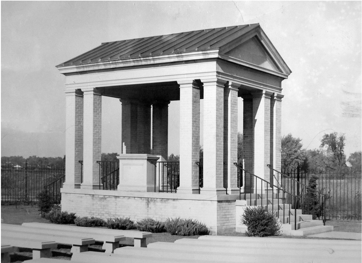
Figure 7. The small neoclassical rostrum at Beverly National Cemetery, New Jersey, built in 1937. A nearly identical rostrum was built of limestone at Camp Butler National Cemetery, Illinois, in 1939. National Archives and Records Administration, Washington, D.C., Records of the Department of Veterans Affairs, Department of Memorial Affairs, National Cemetery Historical File (Record Group 15/A-1, entry 25), maintenance ledger pages for Beverly.