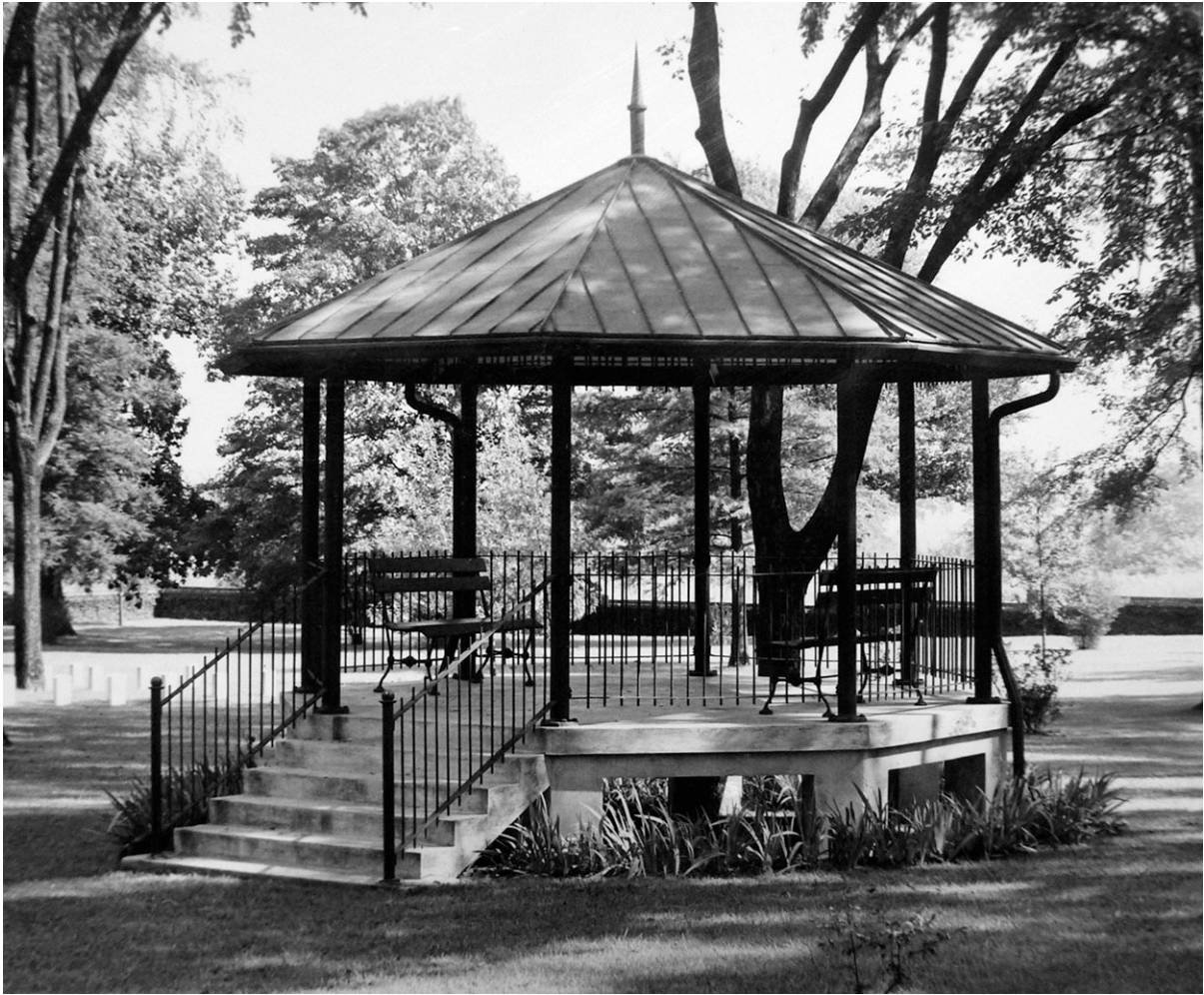
Figure 6. The rostrum at Raleigh National Cemetery, North Carolina, built to the simplified standard plan for rostrums in 1931.