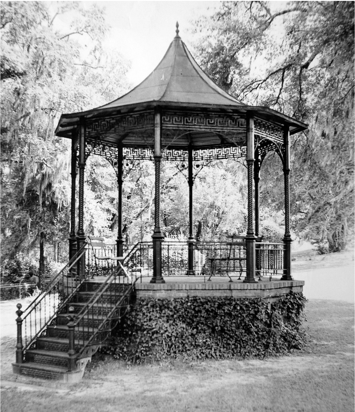
Figure 5. The standard octagonal rostrum at Wilmington National Cemetery, North Carolina, built in 1886. This is one of the first octagonal rostrums, built by the Champion Iron Fence Company of Kenton, Ohio. The sheathing over the roof framework is a later modification. This rostrum still stands, although its superstructure above the level of the handrail was removed in 1958. National Archives and Records Administration, Washington, D.C., Records of the Department of Veterans Affairs, Department of Memorial Affairs, National Cemetery Historical File (Record Group 15/A-1, entry 25), maintenance ledger pages for Wilmington.