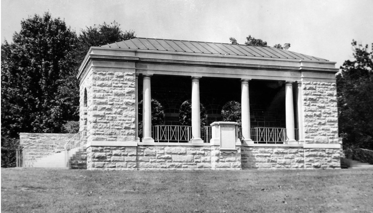
Figure 9. The rostrum at Nashville National Cemetery, Tennessee, built in 1940. This monumental rostrum, nearly identical to one built at Andersonville National Cemetery in 1941, represents the larger neoclassical speakers' stands the Construction Division of the Office of the Quartermaster General was able to build at selected cemeteries immediately prior to World War II. National Archives and Records Administration, Washington, D.C., Records of the Department of Veterans Affairs, Department of Memorial Affairs, National Cemetery Historical File (Record Group 15/A-1, entry 25), maintenance ledger pages for Nashville.