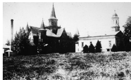
The 1885 tabernacle with central spire, left; the 1867 tabernacle, right. View from Center Street looking southeast.

drawings provided by Truman Angell, the LDS Church architect who also designed the Salt Lake Temple. Before much work had been completed, however, Brigham Young visited the area in 1852 and suggested moving the site of the tabernacle about two miles east, to where Provo’s current tabernacle park is, at the intersection of University and Center Streets. This site was on the outskirts of what had become a fairly substantial town, and it began a controversy among many of the area’s residents who were used to the Mormon custom of having their most important public buildings in the city’s center.