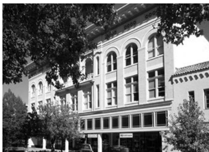
The Taylor Bros. Department Store building was originally built in 1890, and expanded in 1902 and 1911.