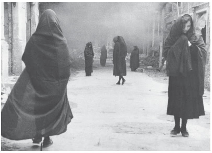
The Tornado (Samir Habchi, Lebanon, 1992).