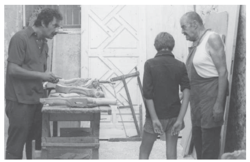
Man of Ashes (Nouri Bouzid, Tunisia, 1986)