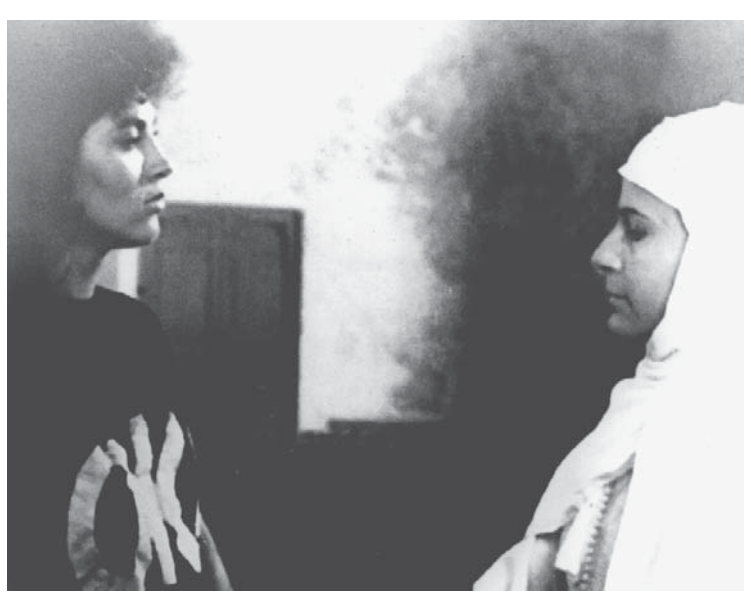
A Door to the Sky (Farida Benlyazid, Morocco, 1988).