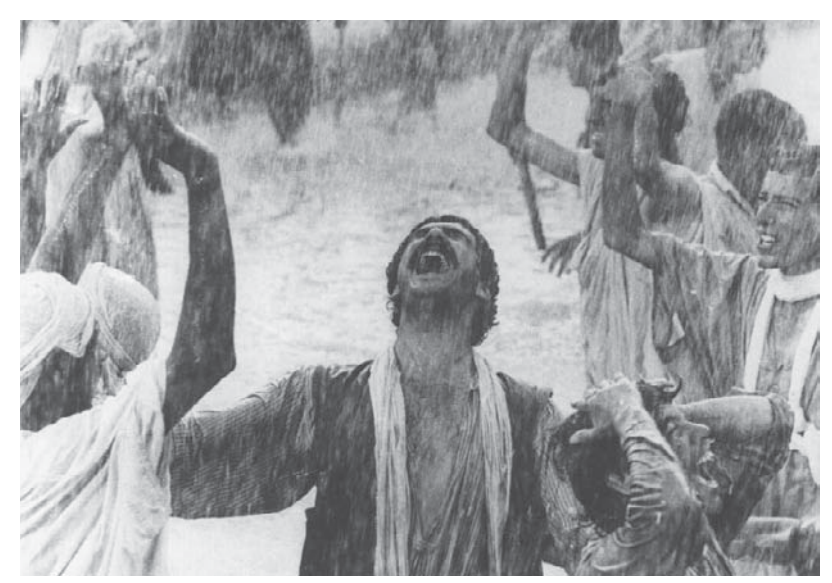
Chronicle of the Years of Embers (Mohammed Lakhdar-Hamina, Algeria, 1975).