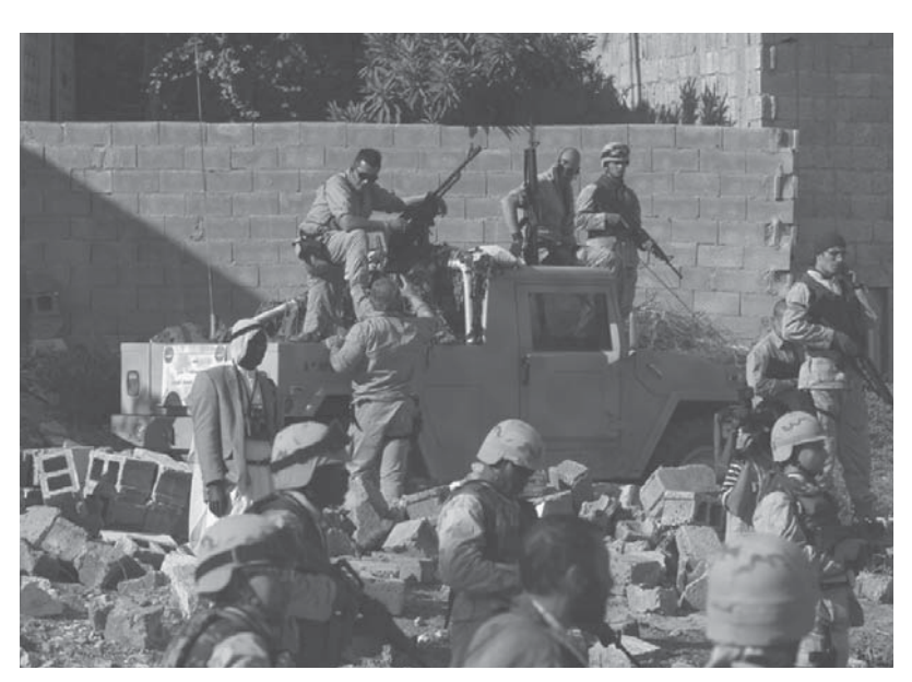
Valley of the Wolves, Iraq (Serdar Akar, 2005). Courtesy of Pana Films