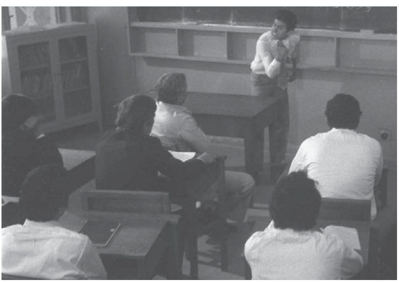
Alexandria, Why? (Youssef Chahine, Egypt, 1978).