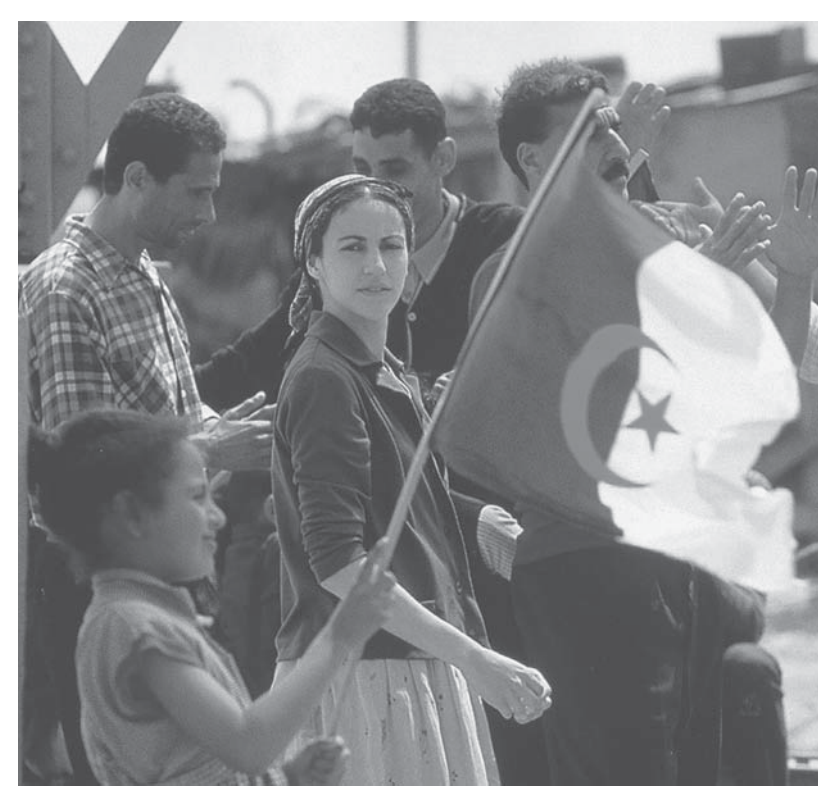
Living in Paradise (Bourlem Guerdjou, France/Algeria, 1998).