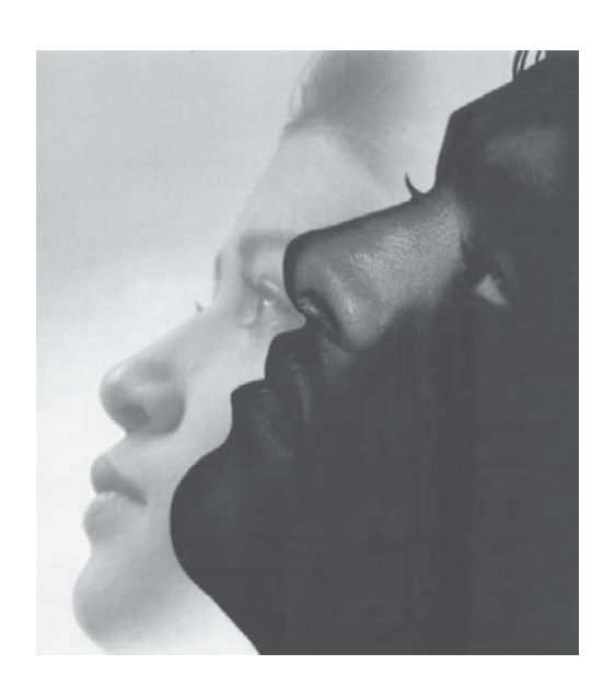
A New Day in Old Sana'a (Bader Ben Hirsi, Yemen, 2005). Courtesy of AFD/Typecast Films (U.S. Distributor)