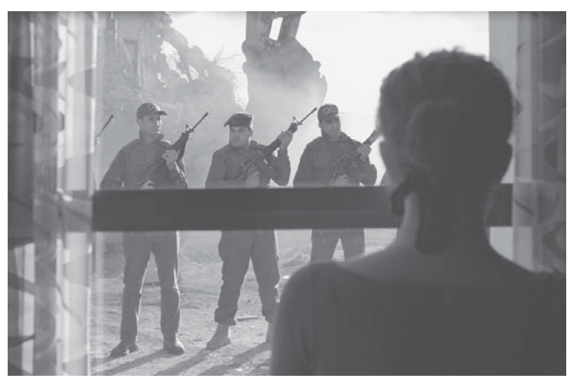
Rana's Wedding: Another Day in Jerusalem (Hany Abu-Assad, Palestine, 2002).