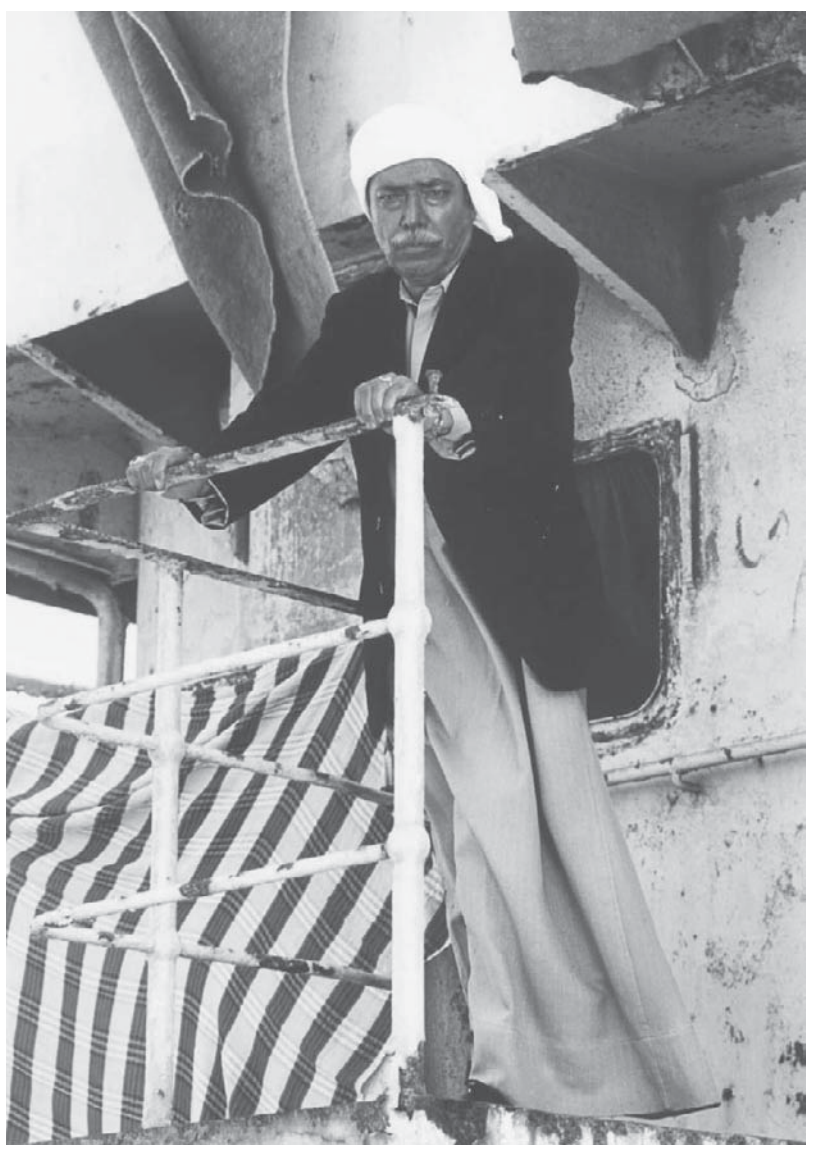
Iron Island (Mohammed Rasoulof, Iran, 2005).