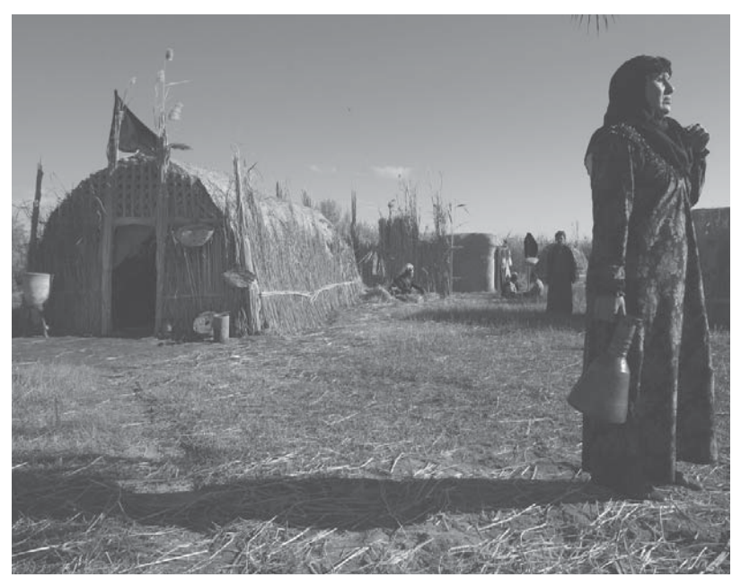
Zaman: The Man from the Reeds (Amer Alwan, Iraq, 2003).