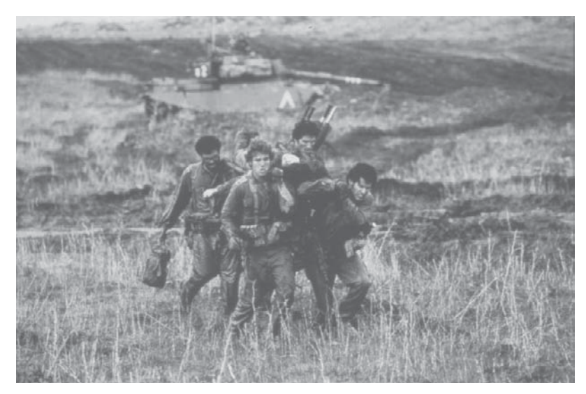
Kippur (Amos Gitai, Israel, 2000).