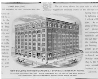
The Sixth Floor Museum at Dealey Plaza

The building known as the former Texas School Book Depository dates back to 1898 when the land it stands on was sold to the Southern Rock Island Plow Company. That company built a five-story warehouse building that was destroyed by fire within a year of being completed. In 1901 the company re-built on the same site, constructing the seven-story building that still stands today.