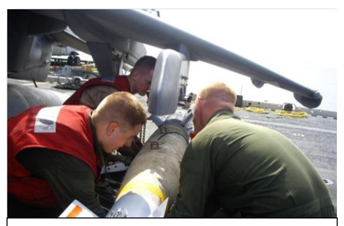
VMA-542 26 MEU Det Ordnance Marines loading a GBU-12 laser-guided bomb during Operation Odyssey Dawn.

The initial operation was to enforce a no fly zone and destroy forces that threatened civilians. VMA-542 Det A began kinetic