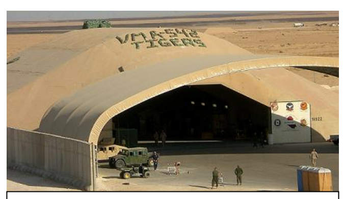
VMA-542 at Al Asad Air Base in Iraq in 2007.

Upon return to Cherry Point, the squadron quickly reset the force, trained and reorganized to source a detachment for 22^{nd}