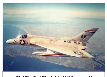
F4D-1 (F-6A) "Skyray"

The squadron remained at MCAS El Toro, and in June 1958 accepted the supersonic, single engine (16,000 lbs. of thrust), afterburning, F4D-1 (F-6A) "Skyray" (affectionately known as the "Ford"). The "Skyray" set world time-to-climb records including a climb to 49,212 feet in 2 minutes, 36 seconds. On October 3, 1953 the F4D-1 became the first carrier capable aircraft to set the absolute world speed record by traveling 753 mph. The "Skyray" became the first U.S. Marine fighter capable of Mach 1