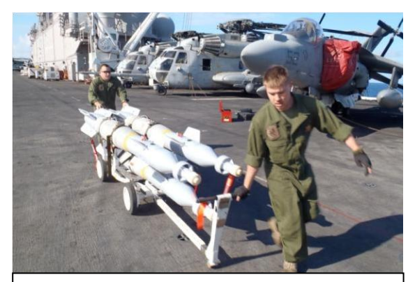
VMA-542 Ordnance Marines attached to VMM-266(REIN) during Operation Odyssey Dawn in Libya.

Kinetic operations continued until 4 April in which VMA-542 Det A flew 86 sorties, 220 hours