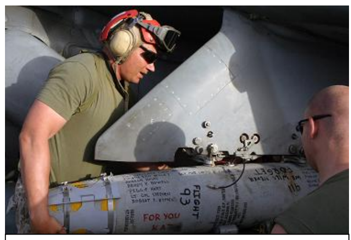
"Tiger" ordnance crew loading a GBU-38 JDAM aboard the USS Iwo Jima for a mission in support of Operation Enduring Freedom.

eight-day operation launched by the U.S. Marines to quell the town and establish order among the populace. The "Tigers" delivered some of the first bombs during the operation resulting in direct hits on high value targets by means of the Litening Pod. In total, VMA-542(-) REIN delivered over 10 tons of ordnance, 220 rounds of 25MM ammunition and flew over 300 combat hours during the eight-day evolution in Fallujah.