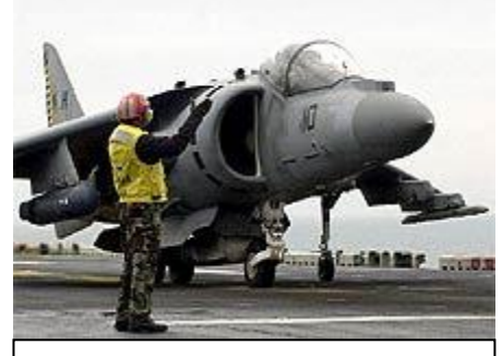
A "Tiger" pilot prepares to launch off of the USS Bataan.

The 22<sup>nd</sup> MEU OEF detachment returned home in September 2002. Less than four months later in January 2003 the "Tigers" embarked for war with Iraq for the second time in 12 years. Working through the holiday season, the squadron packed up and embarked aboard the USS Bataan. For the first time ever, an LHD class ship set sail with an entire squadron of 16 AV-8B II "Harriers." VMA-542 and the Air Department grew together on this historic first, progressing from 4-plane launches to 8-plane goes and eventually executing a 12-jet training strike into Dijbouti to validate the procedures the squadron would use in Iraq. After entering the North Arabian Gulf, VMA-223(-) was transferred from the USS Kearsarge to the USS Bataan, bringing the total number of Harriers working off Bataan's flight deck to 24. Starting March 5th, VMA-542 began supporting Operation Southern Watch/Force in order to enforce the Southern no fly and no move zones in Iraq. A total of 83 sorties were flown by the "Tigers" in support of the operation.