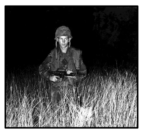
fear of a hidden enemy.

This reflection says an awful lot about the awesome loneliness of nighttime guard duty: