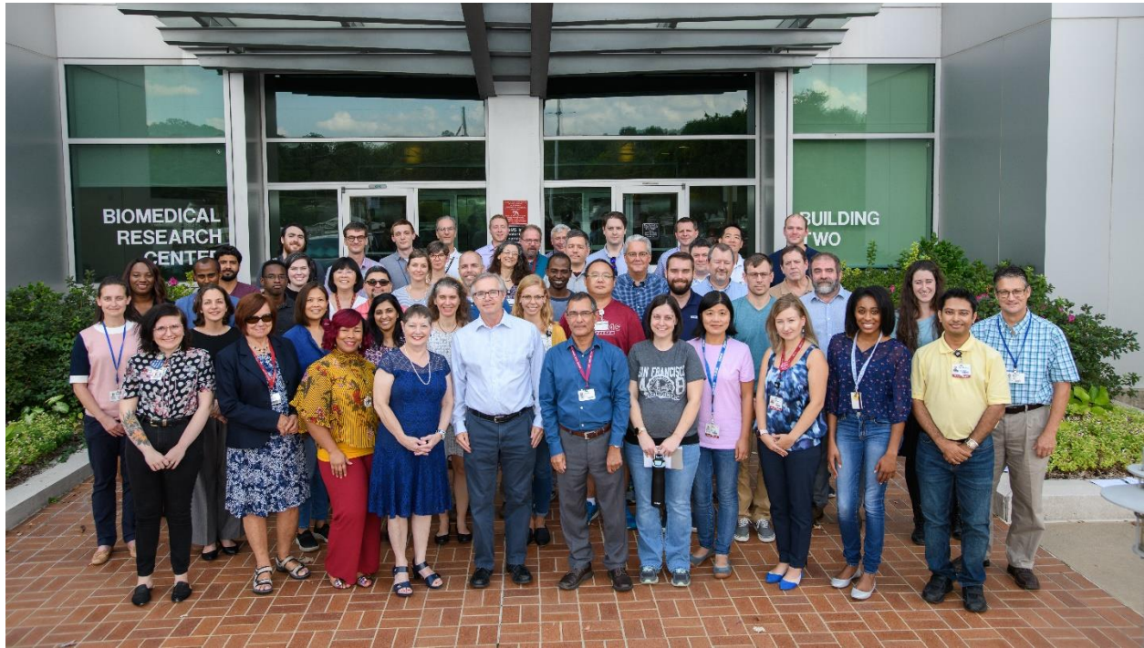
Department of Biochemistry and Molecular Biology, 2019