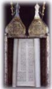
A Hebrew Scroll