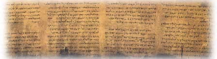
Dead Sea Scroll Fragment