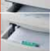
Optional Lower tray