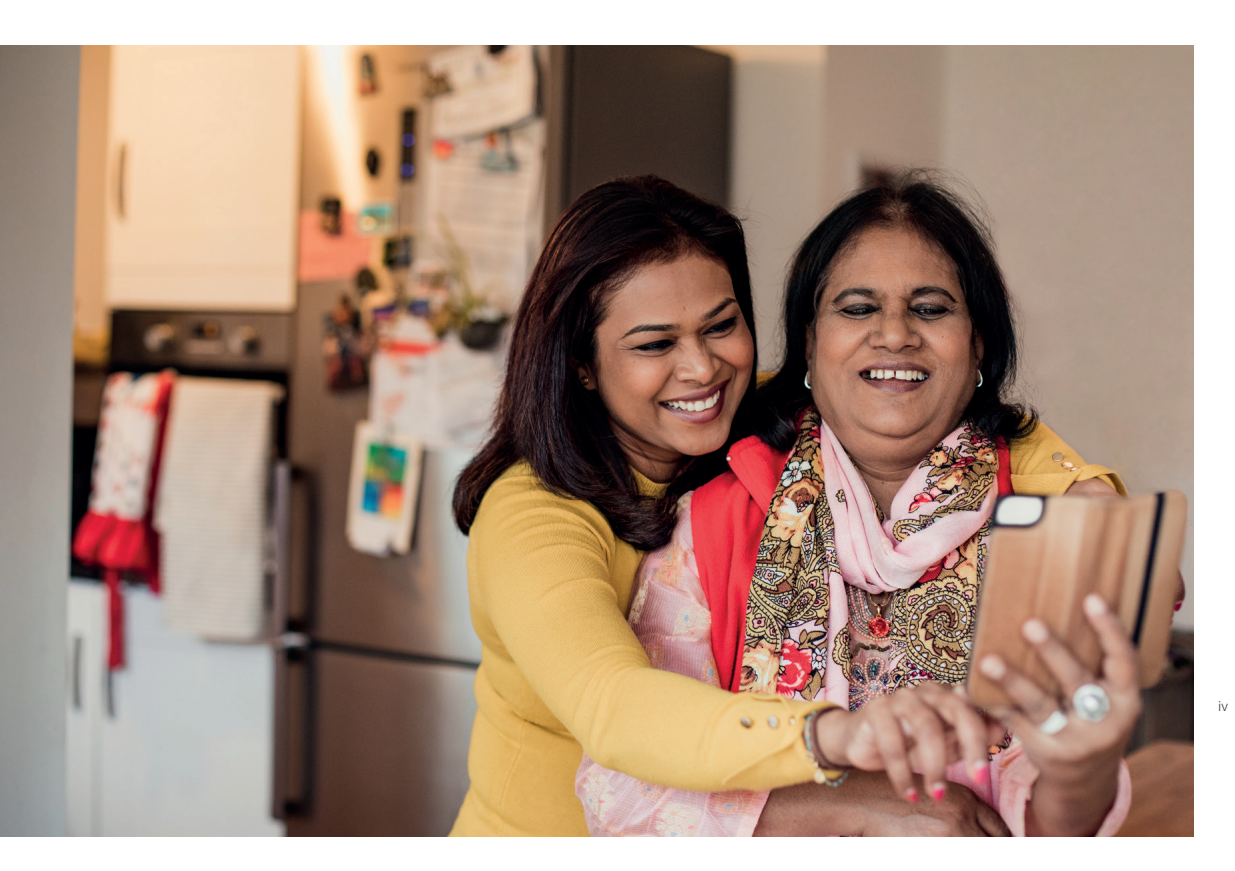
The Carers Innovation Fund applies to England only. Much of the support for unpaid carers is devolved.