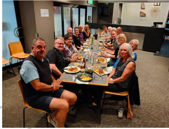
Dinner at Black Buffalo