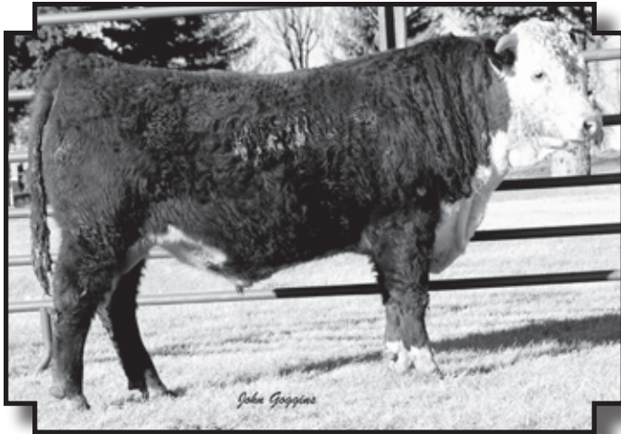
HH Advance 7150T