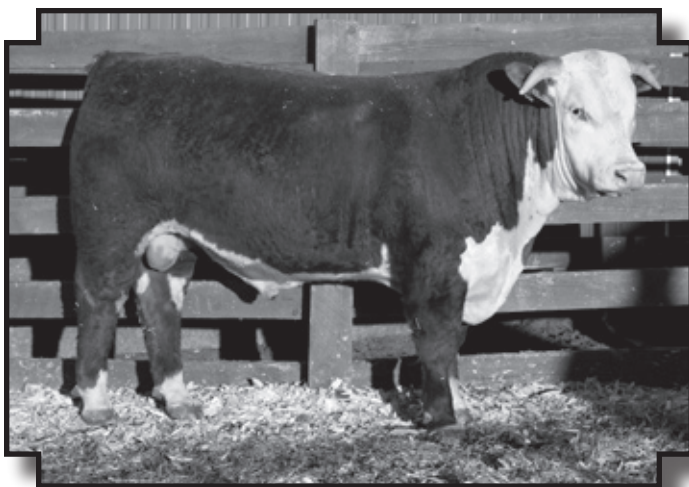
HH Advance 5061R ET