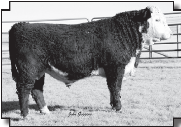
HH Advance 7122T

♦"7121" is another moderate BW, high carcass 571 son with lots of thickness and eye appeal. He ratioed a 113 on IMF with a 13.18 inch REA. Dam is a beautiful uddered 824 daughter.