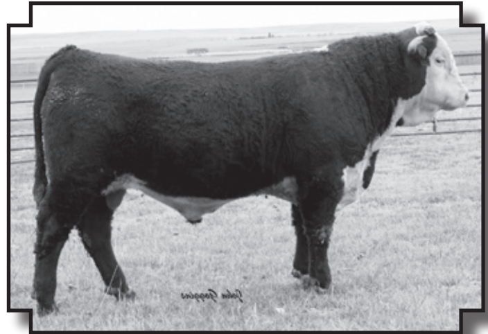
HH Advance 7070T

♦Top herd bull prospect out of the great "255M" carcass sire. "7058" is a well marked, thick made bull with loads of volume and fleshing ability. He ranks in the top 1% of the breed on REA EPD and the top 5% on IMF EPD and scanned a 14.17 inch REA EPD and ratioed 116 on IMF. His dam was one of our best producers and sold for $13,000 in our 2005 cow sale.