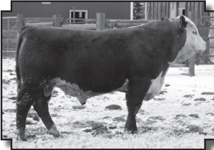
HH Advance 7210T ET

♦Top herd bull prospect by 4140 with 100% pigment and loads of muscle and eye appeal. "7208" has a top notch set of EPD's and scanned a 16.07 inch REA. He is backed by a great cow family and a maternal brother sold in our 2007 sale to Graft Britton Ranch, OK.