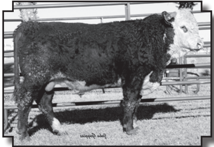
HH Advance 7083T