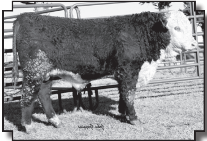
HH Advance 7102T ET