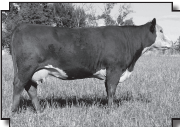
HH Miss Advance 296M Dam of Lots 7110T and 7055T

♦ "7104" is another strong performance and carcass bull by the 3196N herd bull. He ratioed a 106 on IMF and is positive on both REA and IMF EPD's. Dam is a powerful DOD donor cow.