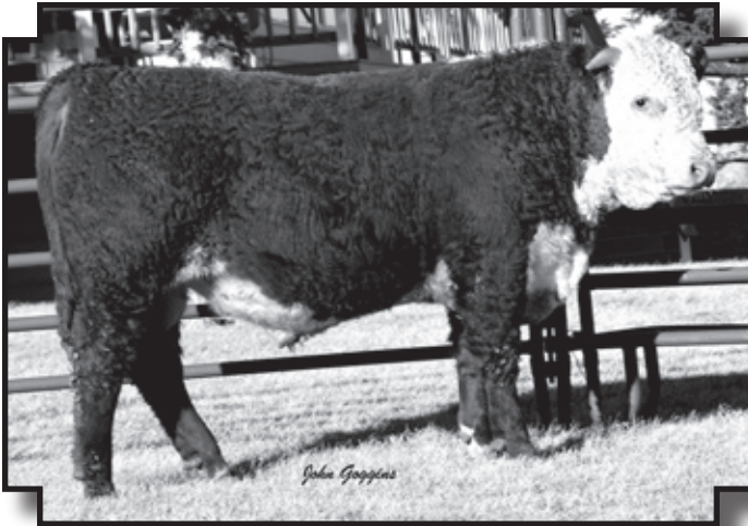
HH Advance 7215T