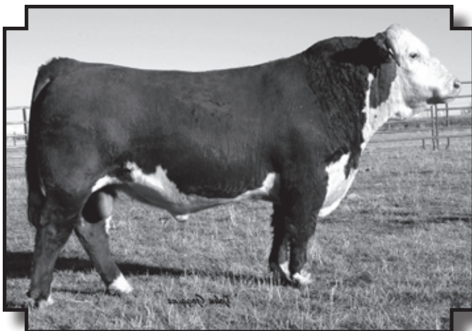
HH Advance 5212R

♦“5104” is one of the best calving ease and performance sires that we have ever used. His progeny have exceptional length, thickness, and eye appeal. He ranks in the top 5% of the breed on WW, YW, Milk, M&G, Scrotal, and REA EPD's. He produced our high sire group at weaning and his dam is a powerful donor cow with a great udder. Owned with B&D Herefords, KS. 10 top quality sons sell!