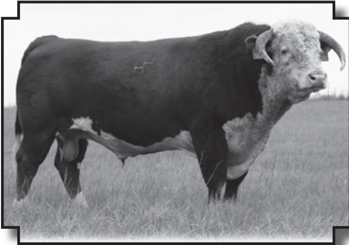
L1 Domino 03571