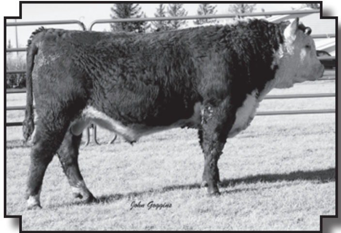
HH Advance 7022T