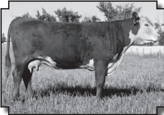
HH Miss Advance 2146 Dam of Lots 7102T & 7218T