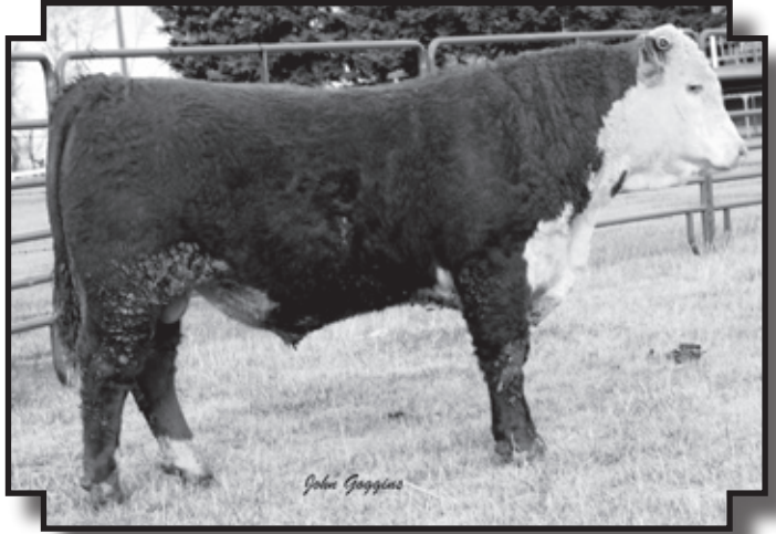
HH Advance 7095T ET

♦“7095” is an outstanding herd bull prospect that combines tremendous growth, maternal, and carcass traits with lots of eye appeal. He is a well marked, deep sided bull with excellent muscle expression. He is backed by a great cow family with 5 generations of donor cows. Full brothers sell as Lots 7084T, 7096T, and 7104T.