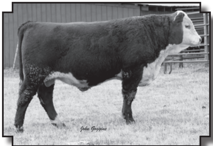
HH Advance 7206T

♦ Long bodied, deep sided 5212 son with plenty of stlye. He has a tremendous set of EPD's including carcass. His dam is the #1 cow in the herd with an average NR of 115 and will be in our donor program this spring.