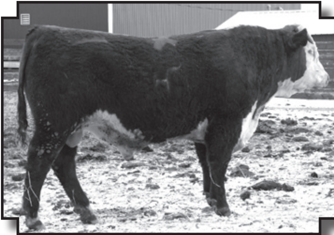
HH Advance 7026T ET