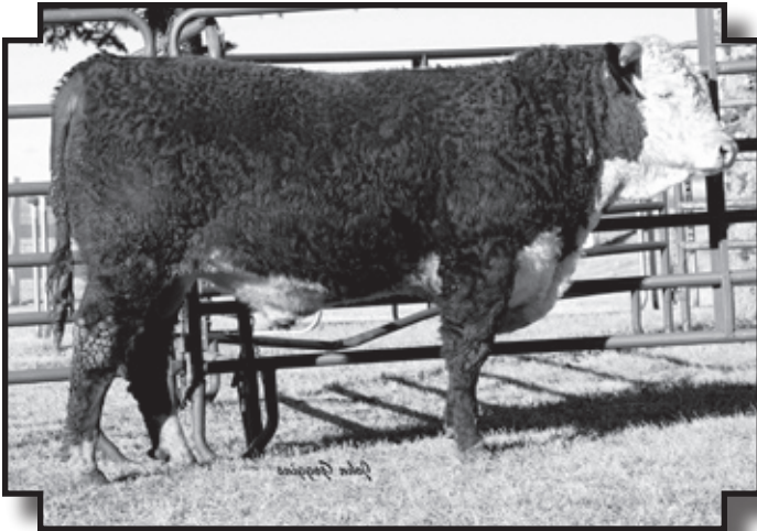
HH Advance 7011T