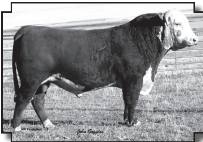
HH Advance 5104R

♦“5061” was the 2nd high selling bull in our 2006 sale. He combines a moderate BW EPD with tremendous maternal strength and solid performance. His progeny are very balanced and complete with lots of thickness and volume. His dam was one of the best cows ever produced at Miles City and a top donor cow for us. Owned with Shafer Ranch, TX. 10 extra complete sons sell!