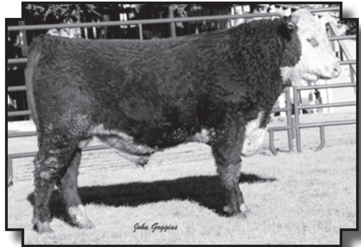
HH Advance 7056T

♦Eye appealing, well marked ET bull out of the great 296M donor cow. "7055" ranks in the top 8% of the breed on WW, YW, Milk, M&G, Scrotal, and REA EPD's. He scanned a 14.17 inch REA EPD and is a full brother to the Lot 7110T bull that is our cover calf.