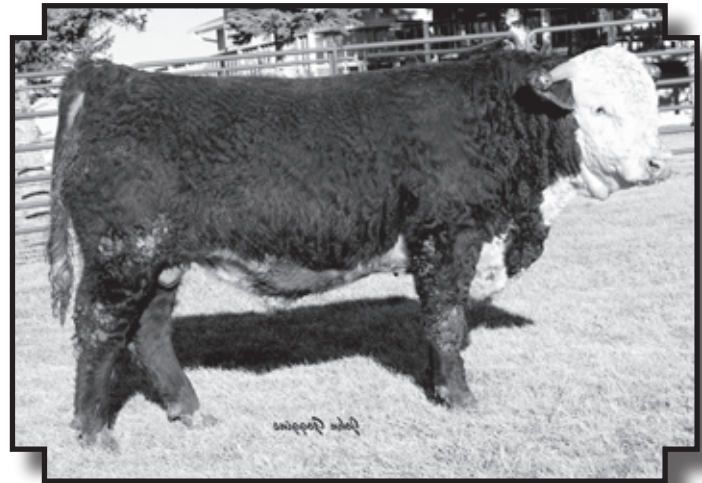
HH Advance 7195T

♦ Maternal brother to our 5212 herd sire. This well marked, stout made 571 son has a very moderate BW EPD and great carcass numbers. His dam is one of our best donor cows and has produced over $100,000 worth of progeny and has herd bulls working at Nunnally Farms, Patterson Herefords, T-Cross Ranches, and Jacobs Ranch. Full brother sells as Lot 7194T.