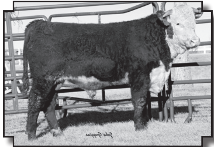
HH Advance 7218T