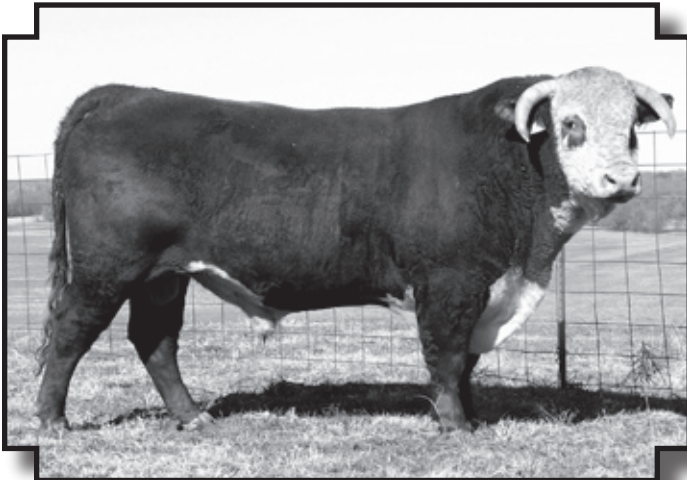
HH Advance 4140P