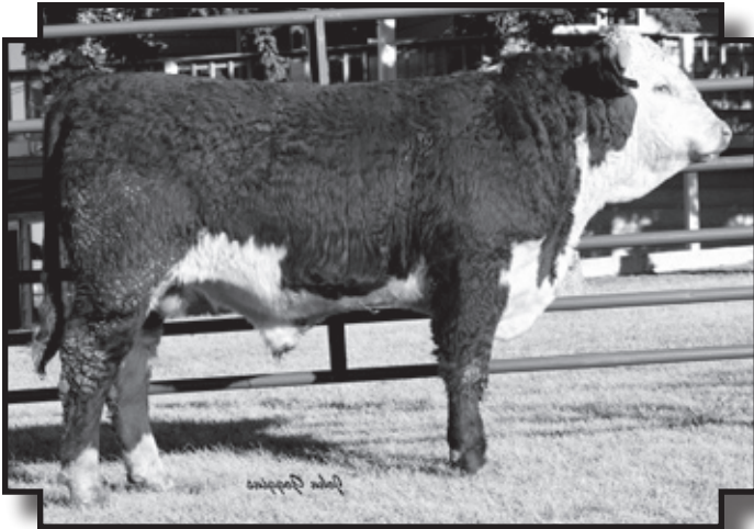
HH Advance 7199T