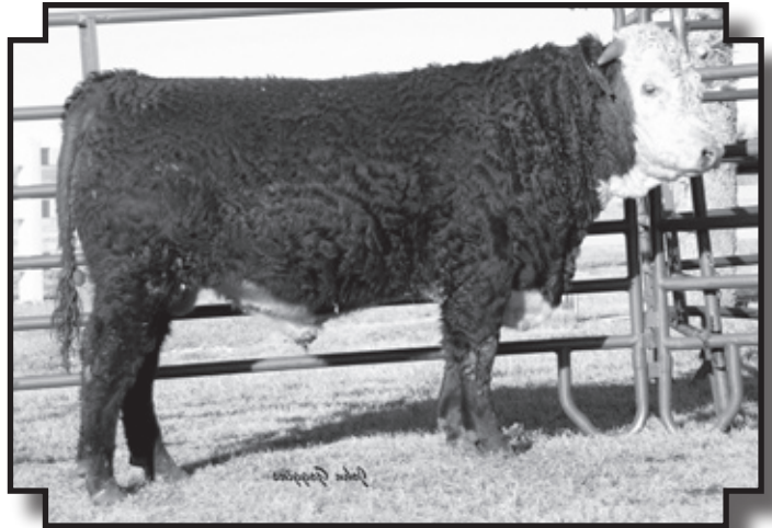
HH Advance 7089T ET