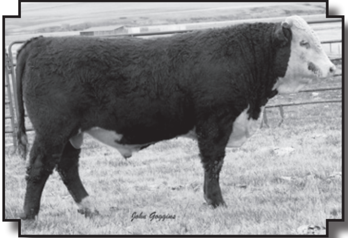
HH Advance 7096T

♦“7096T” is another top notch herd bull prospect out of the 3196 herd sire. He exhibits excellent thickness and eye appeal along with being 100% pigmented. He backs it up with outstanding individual performance and EPD's including REA and IMF EPD's. Full brothers sell as Lots 7084T, 7095T, and 7104T.