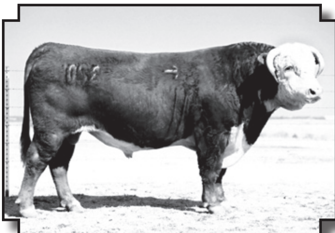
CL1 Domino 320N

♦ "1362" is a Miles City bred bull that we have used with great success. He is a calving ease sire whose progeny are well marked and have extra thickness. His dam is one of the very top cows at Miles City and his daughters have great udders and lots of milk. 8 balanced trait sons sell!