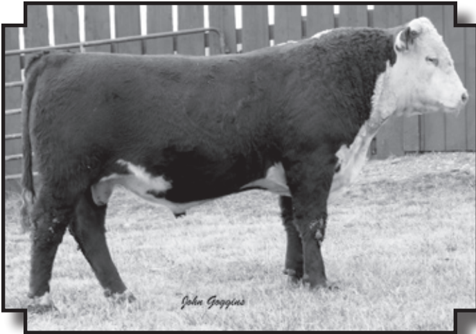
HH Advance 7085T ET