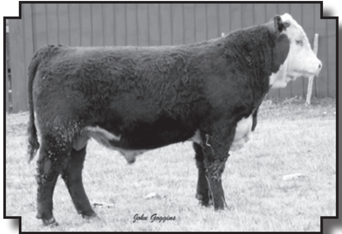
HH Advance 7208T