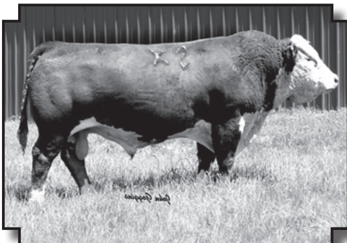
L1 Domino 01362