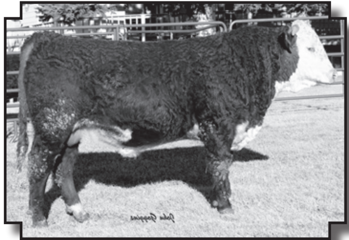
HH Advance 7110T ET

♦ Top notch herd bull prospect that combines tremendous eye appeal and performance with EPD's that rank him in the top 7% of the breed on WW, YW, Milk, M&G, Scrotal and REA EPD's while still being well below breed average for BW EPD. Dam is one of our very top donor cows with loads of milk, a perfect udder, and an average NR of 107. She also produced the pick of our 2006 heifer calves that sold at Denver for $16,500 to Shafer Ranch.