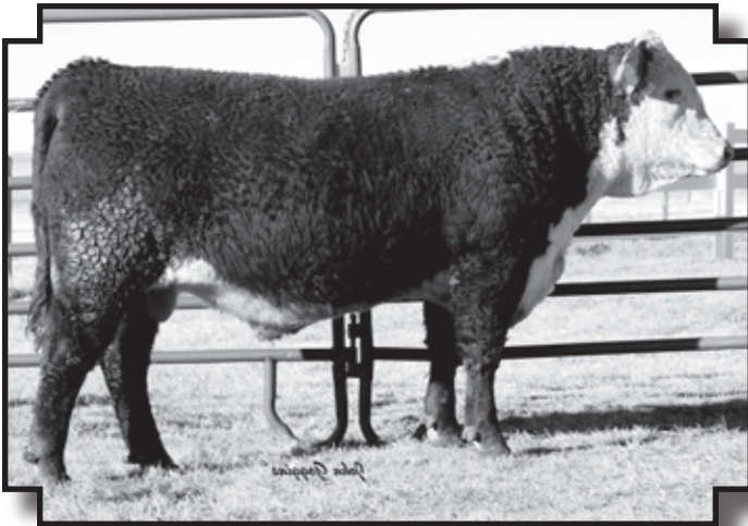
HH Advance 7053T ET

♦Moderate birthweight, high maternal bull with a good IMF EPD.