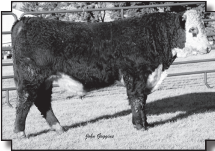
HH Advance 7101T