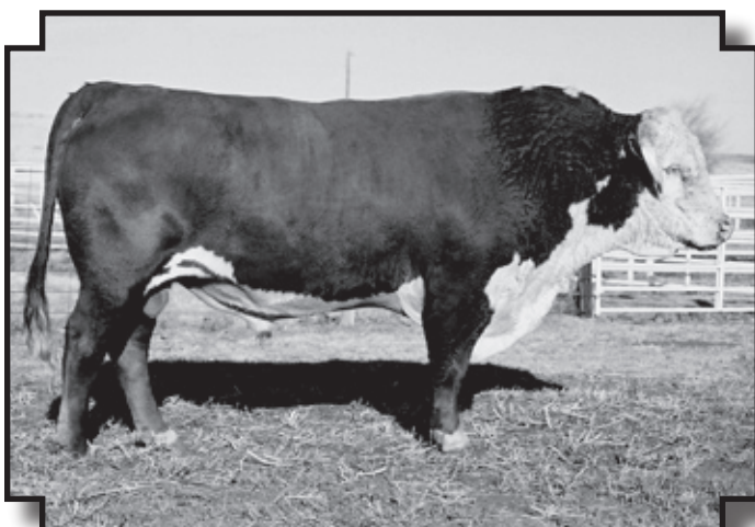
HH Advance 396N

♦ "320N" is a balanced trait bull that does a lot of things right. His progeny are well marked, moderate framed, thick and deep with lots of eye appeal. He is a calving ease bull and has worked well on heifers for us. He is a trait leader for Calving Ease, FT, and IMF EPD's. His dam is a top cow and sold for $20,000 in Cooper's 2005 cow sale. Owned with EE Ranches, KS. and MS. 7 high quality sons sell!