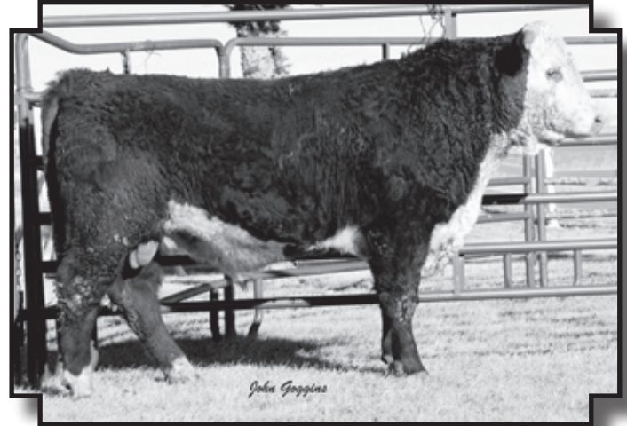
HH Advance 7175T

♦ Tremendous thickness and muscle expression in this short marked 571 son. He also has excellent EPD's across the board and posted a 113 on IMF ratio. Dam is a DOD cow with an average NR of 108.