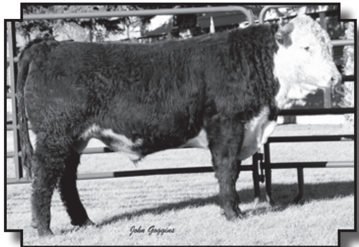
HH Advance 7115T

♦ Big, powerful performance bull with an 836 lb. adj 205 day wt.. "7111" scanned a 14.26 inch REA.