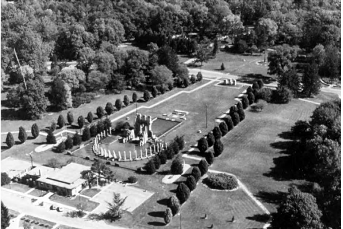
Incomplete Constitutional Mall about 1977