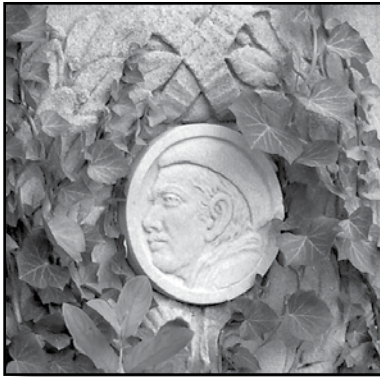
Taflinger Medallion in the Ruins

positioned on either side of the Ruins. Only two remain in 2007, the result of weather, time and vandalism. Two capitals from columns originally at Broadway Christian Church and a stone table once part of an altar at St. Paul's Church were later included.