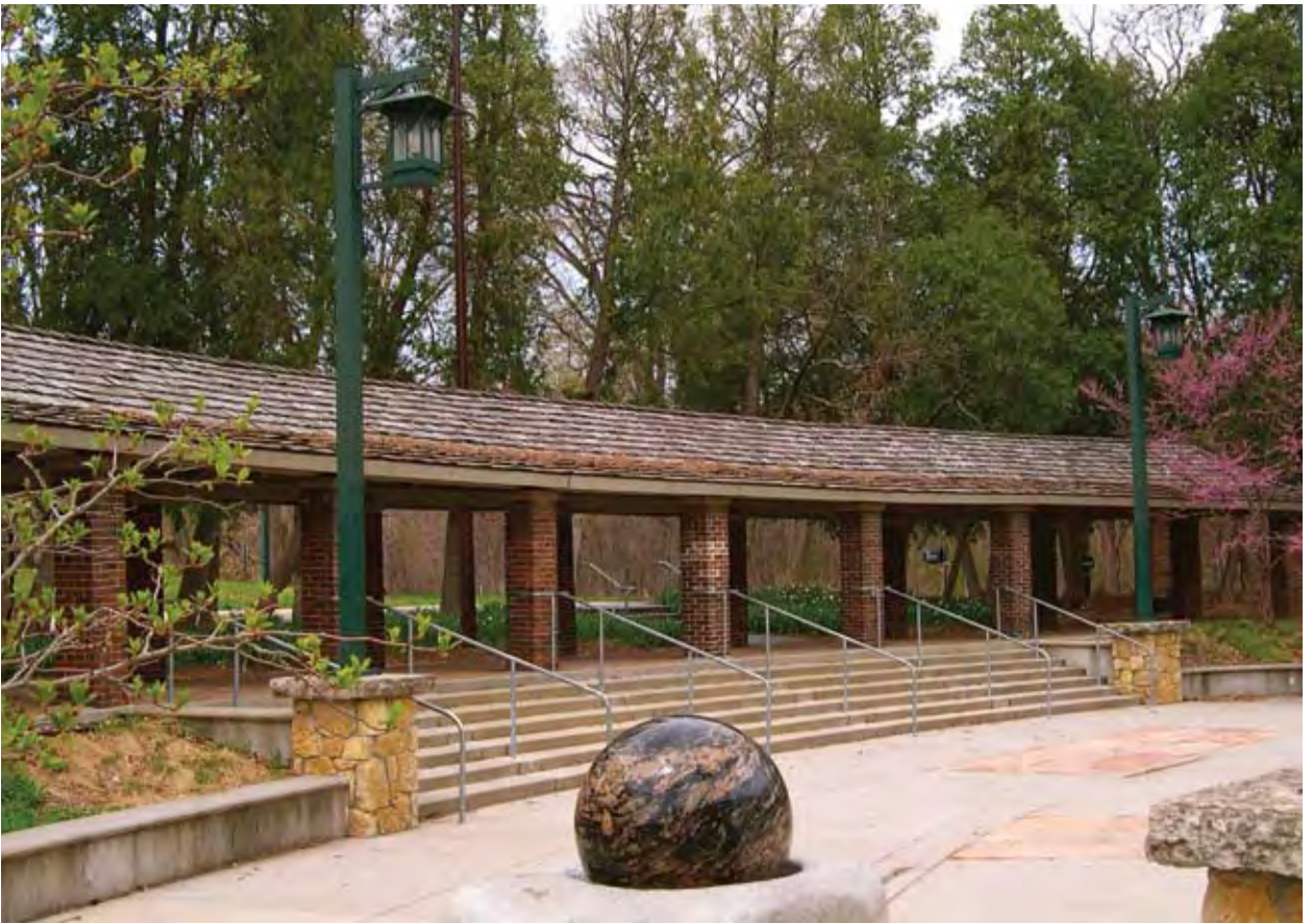
The Pergola at Holliday Park