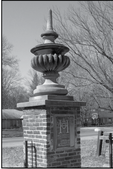
Holliday Commemorative Plaque