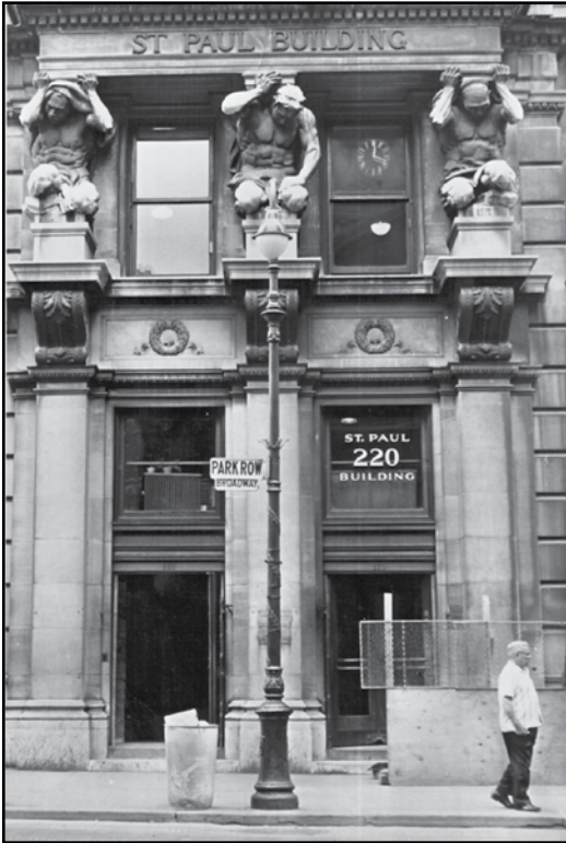
Facade of St. Paul Building with The Races of Man

located between the building and the statues, and two geysers of water would rise from it. Indianapolis artist Elmer Taflinger submitted drawings of the site, and the city estimated that it would spend $25,000 on the installation. The description of plans stated that funds were available for the erection of the structure and that Taflinger would supervise the entire installation.