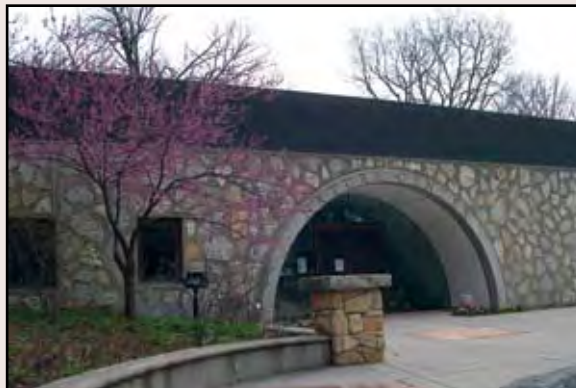
Holliday Park Nature Center