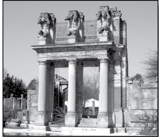
The Races of Man in the park