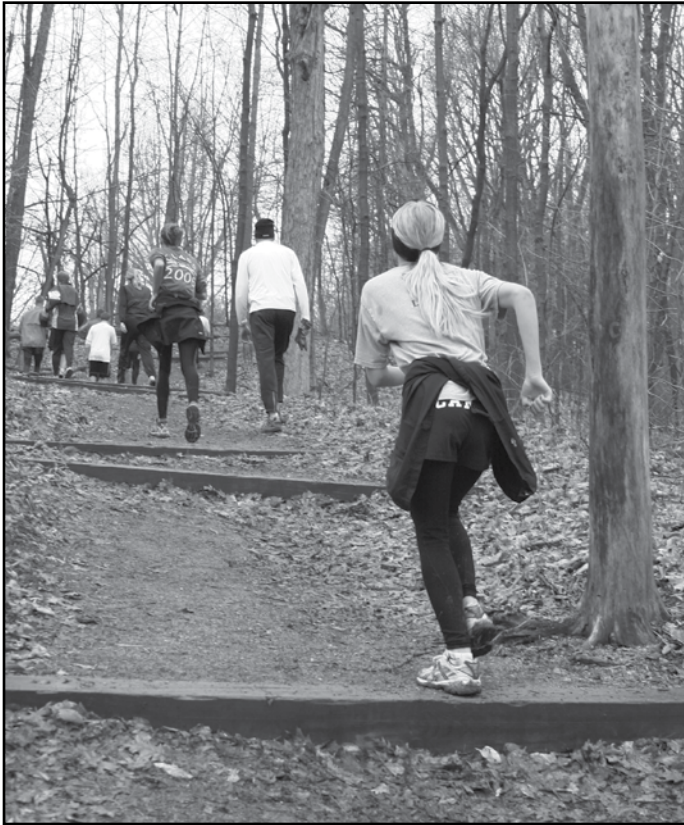
Holliday Park Trail Run