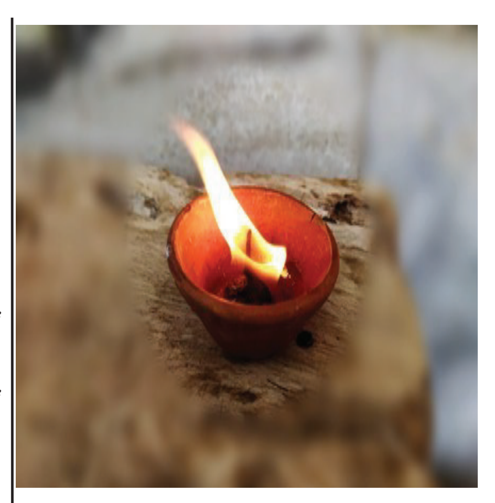
Welcome to the Faith Community at Holy Cross! The pastor, deacon, and our sisters and brothers of this vibrant Faith Community welcome you to celebrate with us today. May the Lord give you peace!

Sacrament of Reconciliation Saturday—4-4:45 PM Sunday—9-9:45 AM Or by appointment.