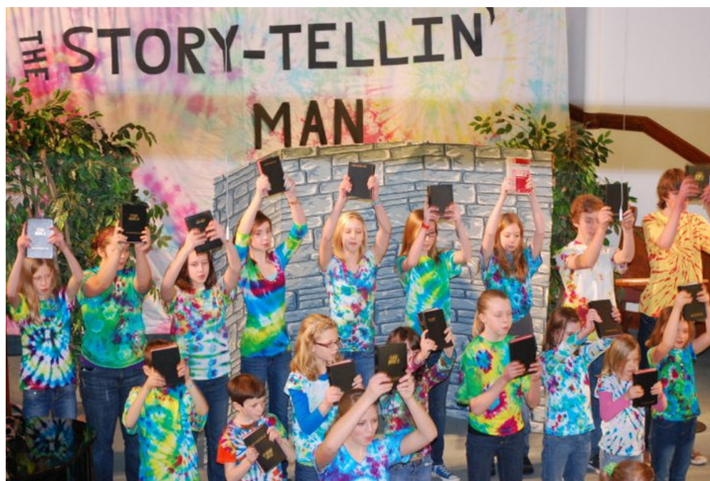
GREAT JOB BY ALL IN THE SPRING MUSICAL "STORY-TELLING MAN"!