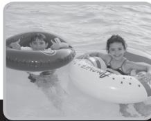
FUN Pool Events

Sunset Pool with a NEW Sprayground opens May 25!