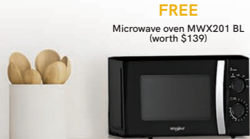
FREE Microwave oven MWX201 BL (worth $139)