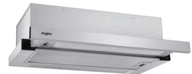
AKR9152IXDS-C 90cm Telescopic Hood