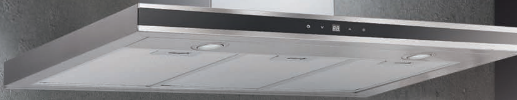
AKR1912 IXS 90cm T-Box Hood