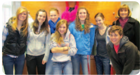
Boise High Spanish Club – preparados de pollo sopa de tortilla, sopapillas, y jarittos para la cena