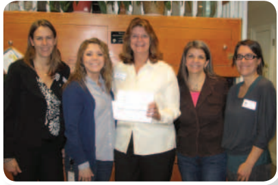
Scentsy check presentation – Funds provided by Scentsy through their employee volunteer service program