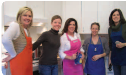
Junior League of Boise – scheduled several shifts so all members were involved