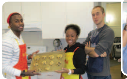
Mtn. Home AFB groups – challenged each other to a cookie bake off