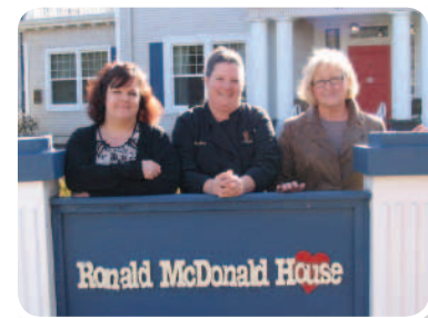
Simplot – prepared dinner and made main and side dishes to be frozen and used in the future