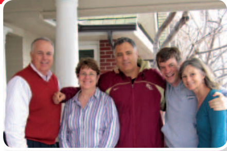
ConAgra Foods Lamb Weston – held a BBQ for families, volunteers and staff