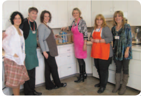
St. Luke's Financial Services – prepared cookies in lieu of financial statements