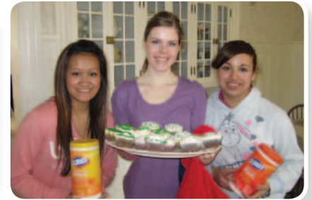
AVID – group baked treats, cleaned, and sanitized the palyroom toys