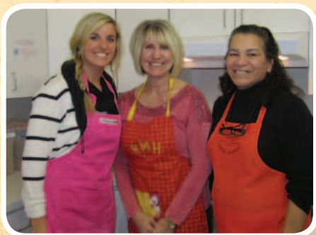
Target group – prepared a delicious Italian feast