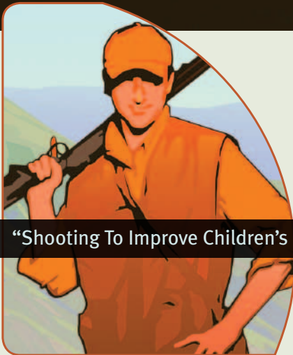
“Shooting To Improve Children’s Lives”

WESTERN STATES CAT • RONALD MCDONALD HOUSE • BLACK DOG CLAYS