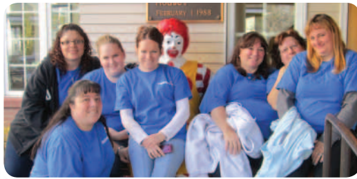
Wal-Mart group – organized the pantry, unpacked donations, moved items to garage