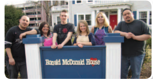
Scentsy group – made lasagna and some tasty side dishes