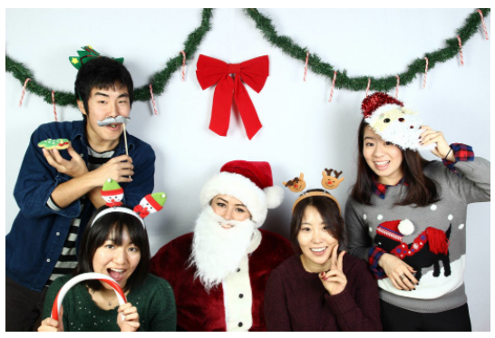
Things your host family would appreciate

Do not invite a person of the opposite sex to stay overnight with you in your host family's home.