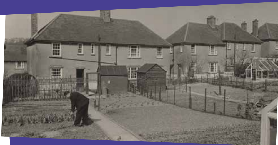
Moulsecoomb around 1950

We're putting the spotlight on 100 years of council housing.