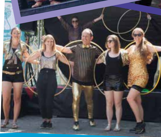
Our City Dances Festival