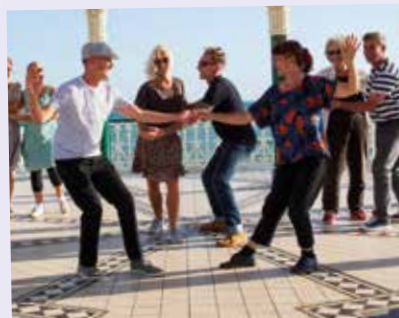
Brighton Lindyhoppers are holding an event at the festival

Brighton & Hove Ageing Well Festival (formerly the Older People's Festival) runs from 30 September to 13 October.