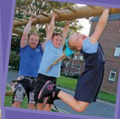
Trying out the new trim trail