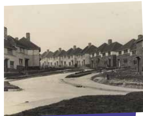
Manor Farm, Whitehawk in the 1930s

In 2013, the first new council homes in over 20 years were completed at Balchin Court in Wellington Road, Brighton and, a century after the Addison Act, we are still building council homes. More than 180 homes have been built across the city over the last four years through New Homes for Neighbourhoods, with many more underway. See page 5 for more information.