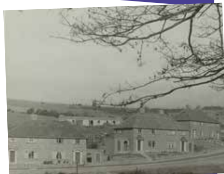
Lower Bevendean in its early days