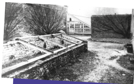
Stanmer's greenhouse around 1945

To find out more visit www.brighton-hove.gov.uk/stanmernews or call 01273 292929.