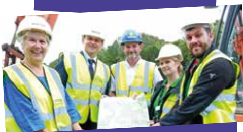
Marking the start of restoration of Stanmer Park

*Plumpton College at Stanmer Park is located south-west of Stanmer House, along a narrow roadway leading left from the T-junction behind the church. Travel by bus using the weekend hourly number 78 bus, which goes right into the park. Get off at Stanmer Village and it's just a few minutes walk. Visit www.brighton-hove.gov.uk/breezebuses . Car parking on the college site is very limited.