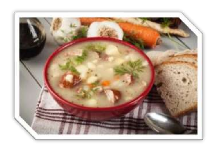
Polish Sour Soup