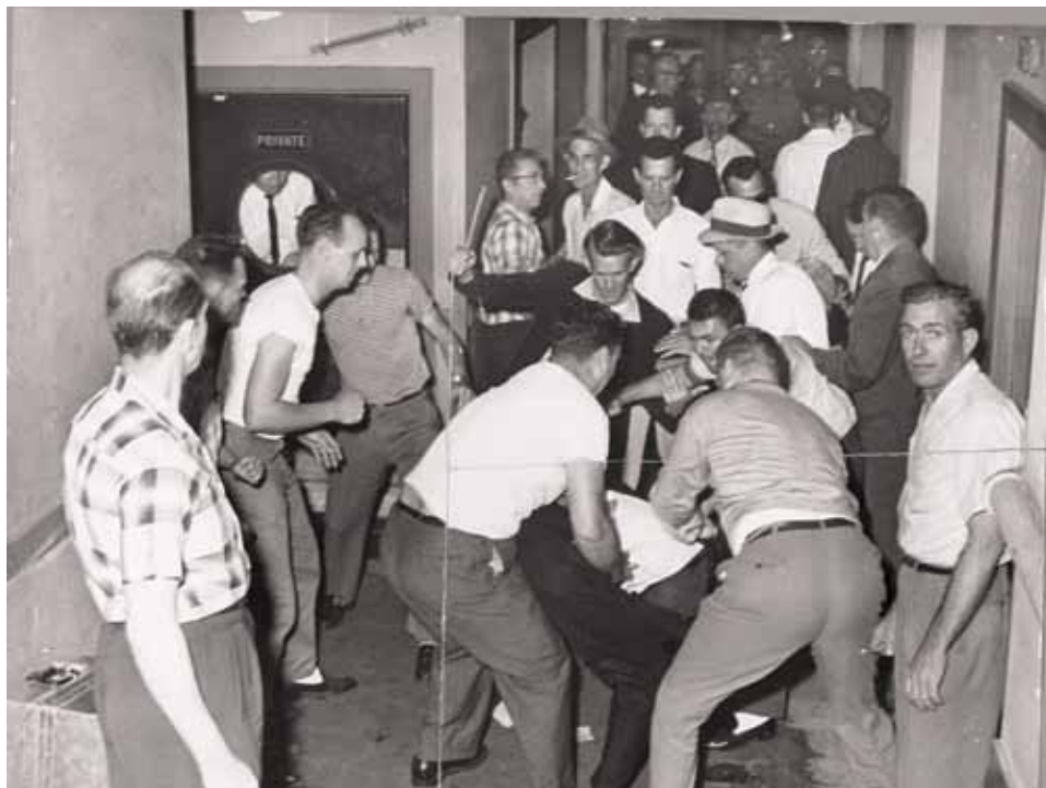
Federal Bureau of Investigation

As World War II broke out in Europe, President Roosevelt asked citizens and police to report sabotage