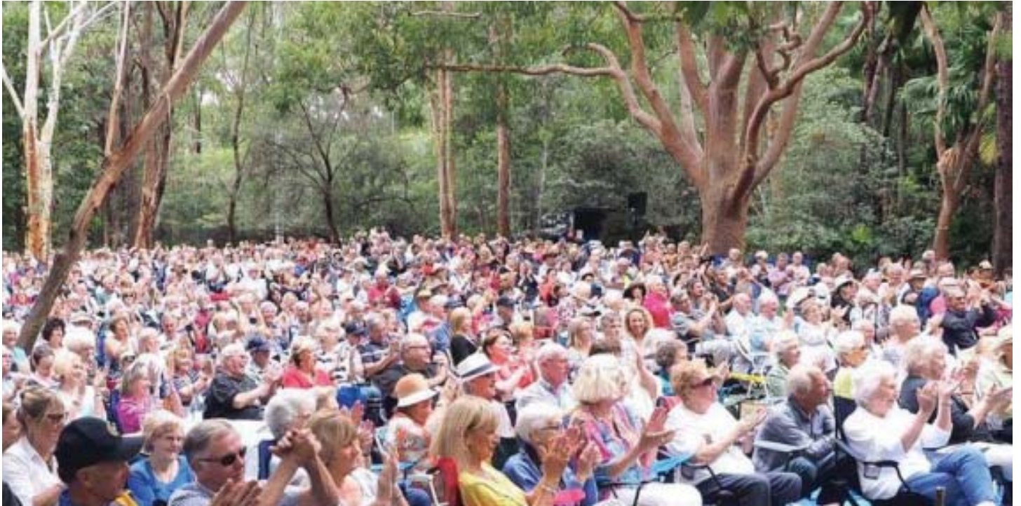
The 2017 Opera event drew a large crowd

Proceeds from the annual open-air charity event, Opera in the Arboretum, to be held at Pearl Beach on March 24, will go this year to Rotarians Against Malaria, Australian Rotary Health and the Zimbabwe Pensioner Support Fund.