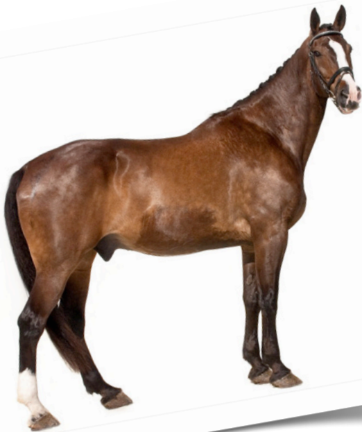
LJ, the Shire Sport Horse*

*See the Horse Breeds Vocabulary Packet for a list of horse breeds and their description.