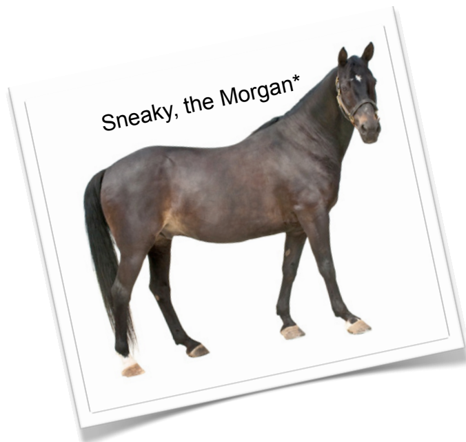
Sneaky, the Morgan*