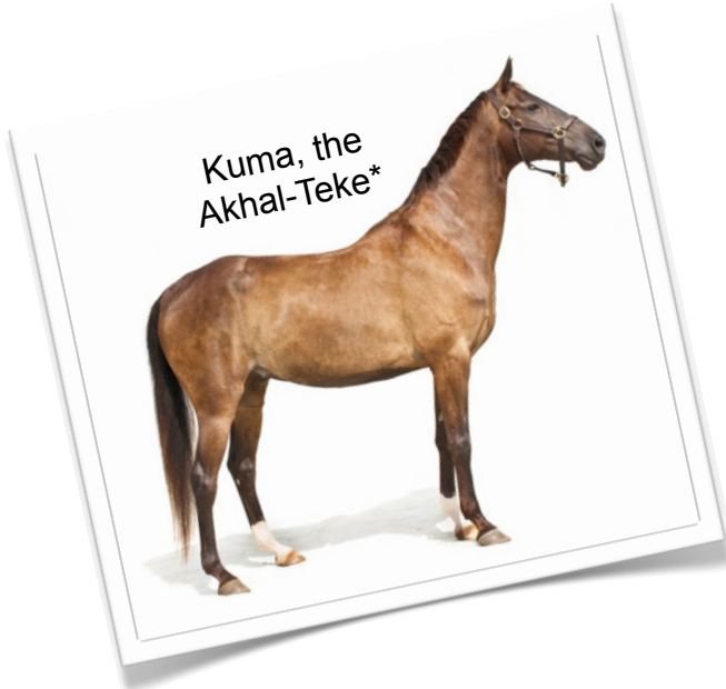
Kuma, the Akhal-Teke*

A breed from Turkmenistan, the Akhal-Teke is a great horse for long distances and desert conditions. The horse needs little water while traveling over an extended period of time. It is also a very elegant horse and is used in different equine disciplines. It is an average of 15 to 15.1 hands high.