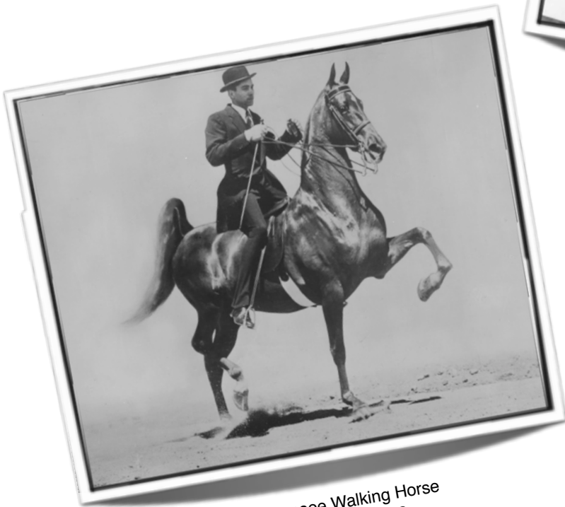
Tennessee Walking Horse ID# 992.07.1233