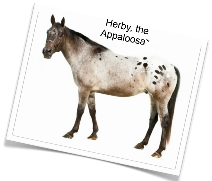
Herby, the Appaloosa*

Bred by the Nez Perce Indians, the Appaloosa has a distinct spotted coat and is an average of 14 to 16 hands. It is a good saddle horse and can be used for show and stock work. It has unique features in addition to the coat pattern including mottled skin and striped hooves.