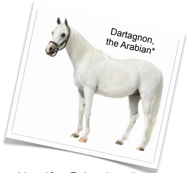
Dartagnon, the Arabian*

The Arabian is the oldest pure breed in the world. This elegant and intelligent horse is known for its endurance over long desert journeys. It was often used as a war horse, and it is prized for its beauty and speed. They are usually 14.2 to 15 hands high.