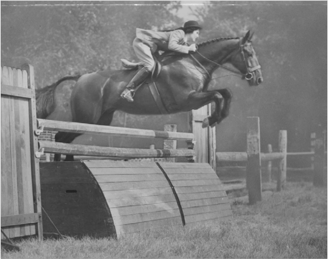
Horse and rider going over jump ID# 992.07.1236

*This packet is intended for older middle school students and young high school students.