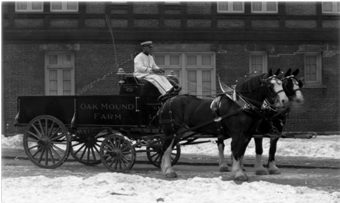
Clydesdale horses pulling a wagon. ID# 991.26.0141

On the other hand, smaller, more compact horses are used in equine sports and for racing. These horses were bred by wealthy men in order to provide them with different hobbies and sports. Sport horses tend to be mid-sized (around 15 hands ). Thoroughbred racing, dressage, and show jumping are just some of the equine disciplines and sports developed by wealthy Europeans.