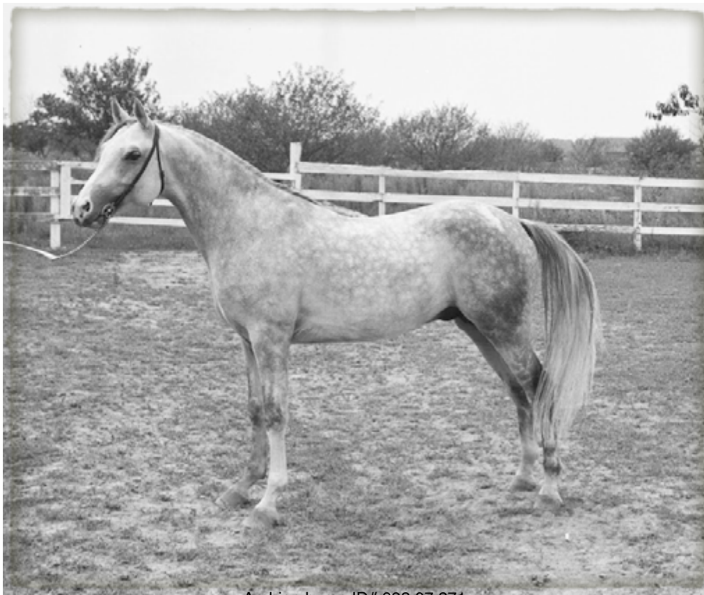
Arabian horse ID# 992.07.271

Many of these horses are native to the steppes of Asia, an area with extensive grasslands. Some of these grasslands, especially in colder climates, tend to have few resources for the horses. The vast, harsh environment of the Asian steppe has led to the development of a hardy horse able to travel over long distances.