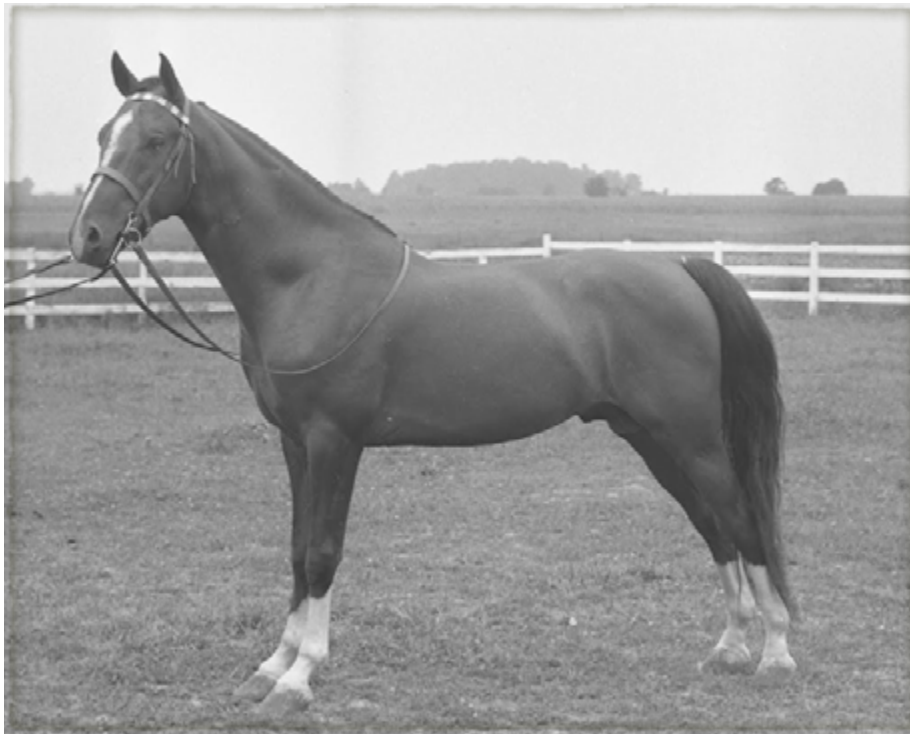
Morgan horse ID# 992.07.270

Plantation owners developed some of the North American breeds of horses. These men needed sturdy, fast horses to ride while surveying their land. These horses were also used for traveling as they were easy and comfortable to ride for long periods of time over the vast colonies.