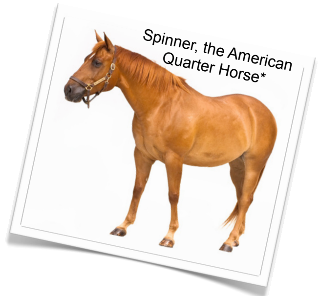
Spinner, the American Quarter Horse*

The American Quarter Horse can be used for all types of activities like ranch work or leisure riding. A speedy breed, the horse was developed by early Southern colonists and is known for its fast quarter-mile sprints. Before Thoroughbred racing became popular, the American Quarter Horse was the popular race breed. After the Thoroughbred replaced it, the horse was used for cow herding and short distance travel. Today, it is the most popular breed in America, and it stands 14 to 16 hands high.