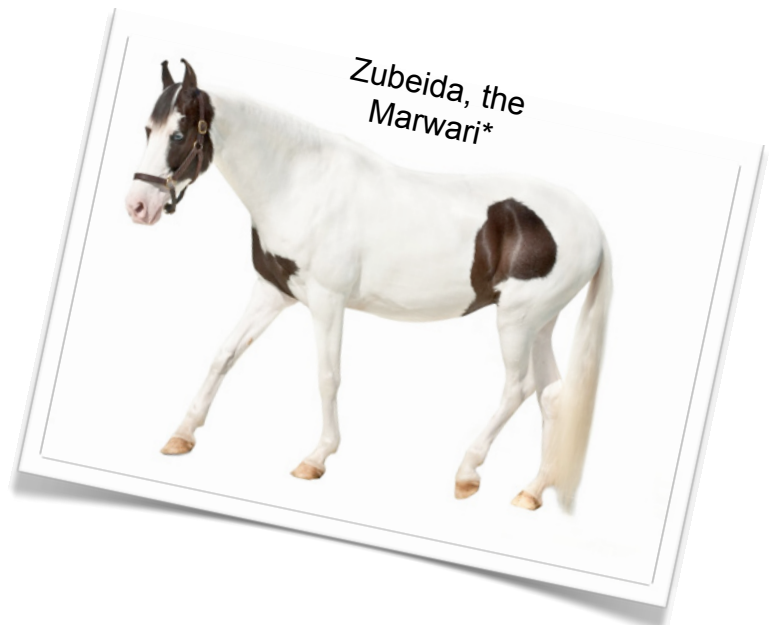
Zubeida, the Marwari*

The Marwari is an Indian breed known for being very tough with a great amount of endurance. The Marwari needs little food and is capable of traveling long distances. The horse is can be used for farm work, and it is known for its unique ears that curve inwards, the tips of the ears sometimes even touching. The Marwari has an average height of 14 to 15.2 hands.