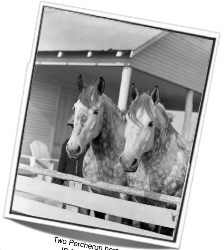
Two Percheron horses ID# 991.26.0921