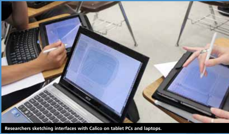
Researchers sketching interfaces with Calico on tablet PCs and laptops.

from all different angles. Novices on the other hand, worked on a single topic at a time, often for extended, drawn-out discussions. Van der Hoek notes: "These differences have serious implications for how we train software engineers and what tools we provide to them. A focus on design behaviors, rather than design notations, is necessary. Especially at the whiteboard, where rough design sketches are prevalent, we need to learn, document, and share the practices of those who successfully work through design problems."