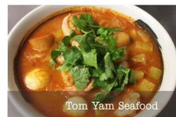
Tom Yam Seafood

*Please let your server know of any food allergies. Consuming raw or undercooked meats, poultry, seafood, shellfish, or egg may increase your risk of foodborne illness, especially if you have certain medical conditions.