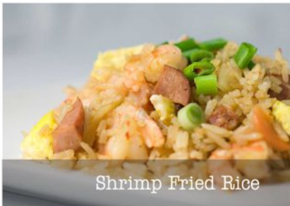
Shrimp Fried Rice