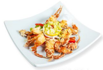
*Soft Shell Crab