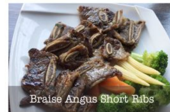
Braise Angus Short Ribs