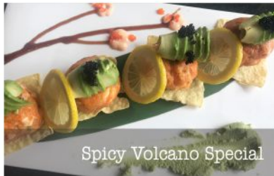
Spicy Volcano Special