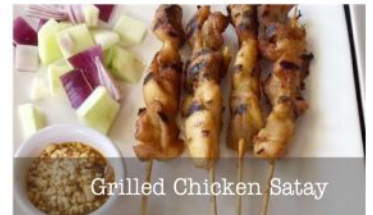
Grilled Chicken Satay