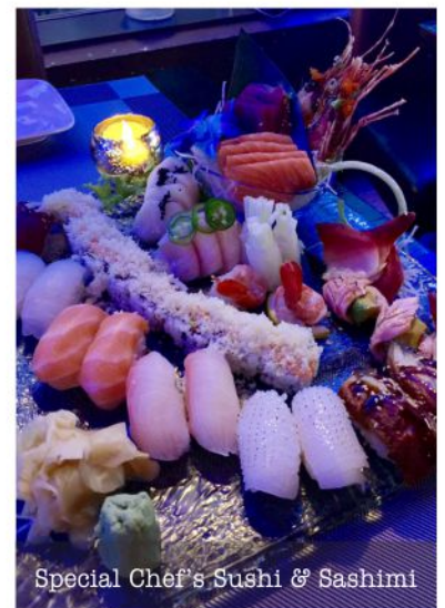
Special Chef's Sushi & Sashimi