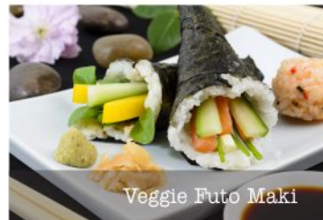
Veggie Futo Maki