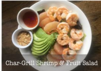
Char-Grill Shrimp & Fruit Salad