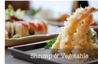
Shrimp & Vegetable