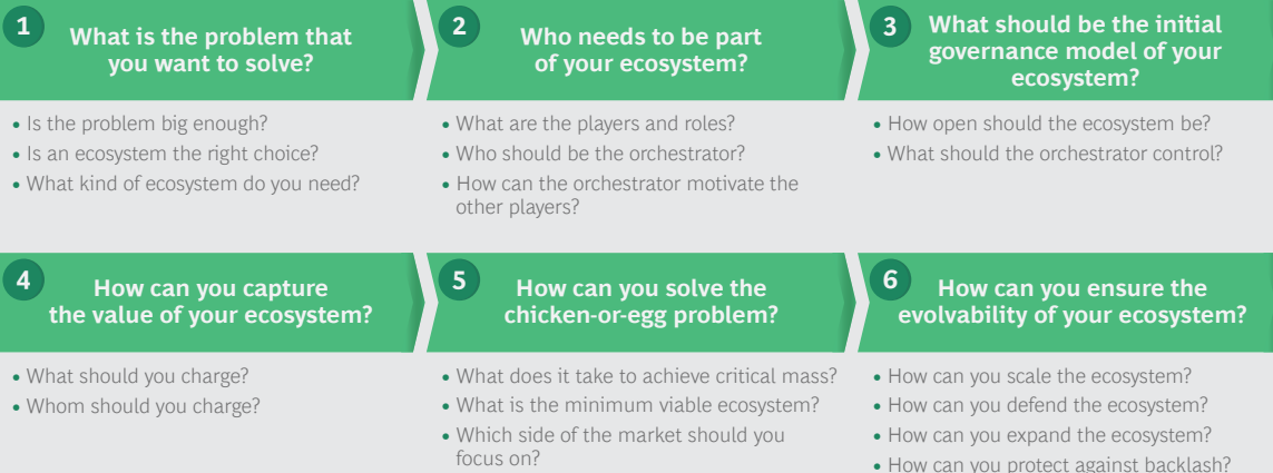
EXHIBIT 1 | The Six-Step Journey of Business Ecosystem Design