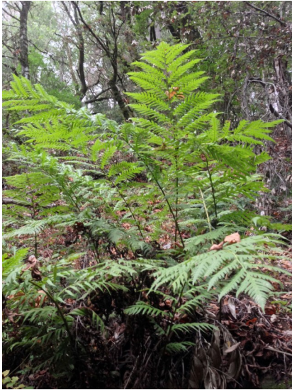
Chain Fern on the San Lorenzo