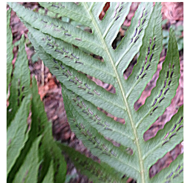
Chain Fern frond bottom-side

“Only spread a fern-frond over a man's head and worldly cares are cast out, and freedom and beauty and peace come in.” John Muir