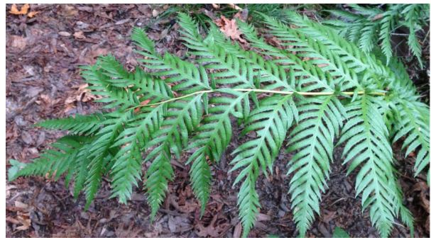
Chain Fern frond topside

Giant chain ferns are found in the west from British Columbia south into Baja California. They grow in full to partial shade where water is plentiful – along streams and year-round seeps and springs. Attached photos are from the headwaters of the San Lorenzo River.