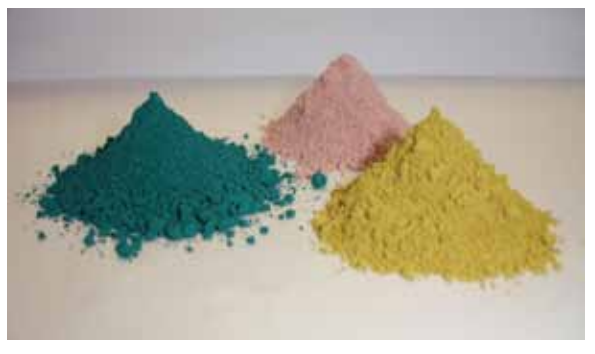
The raw colors of the assorted stains above are close to the actual fired color.

Depending on the use, pigments may be used straight and just mixed with water, but they are more commonly added as colorants in clay bodies and glazes. Some pigments are specifically formulated for clay bodies while