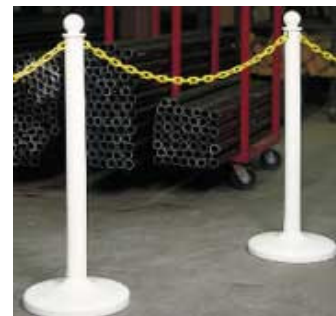
Fig.3 Posts and chain barrier to help separate people from a hazard

To be of maximum true value, your system needs the broad support of people within your organisation. This is often best achieved with a softly, softly approach - consultation, communication, then participation in introducing changes. The following guidance may be useful: