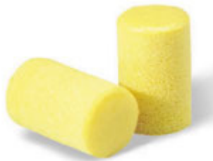
Fig.2 Foam ear plugs are a simple form of PPE