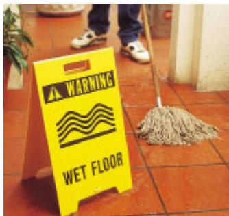
Fig.1 Floor Signs warn people of a slippery floor

Implementation may include tasks such as risk assessments being performed, and physical risk control measures such as barriers, labeling, and signage, and PPE (Personal Protective Equipment).