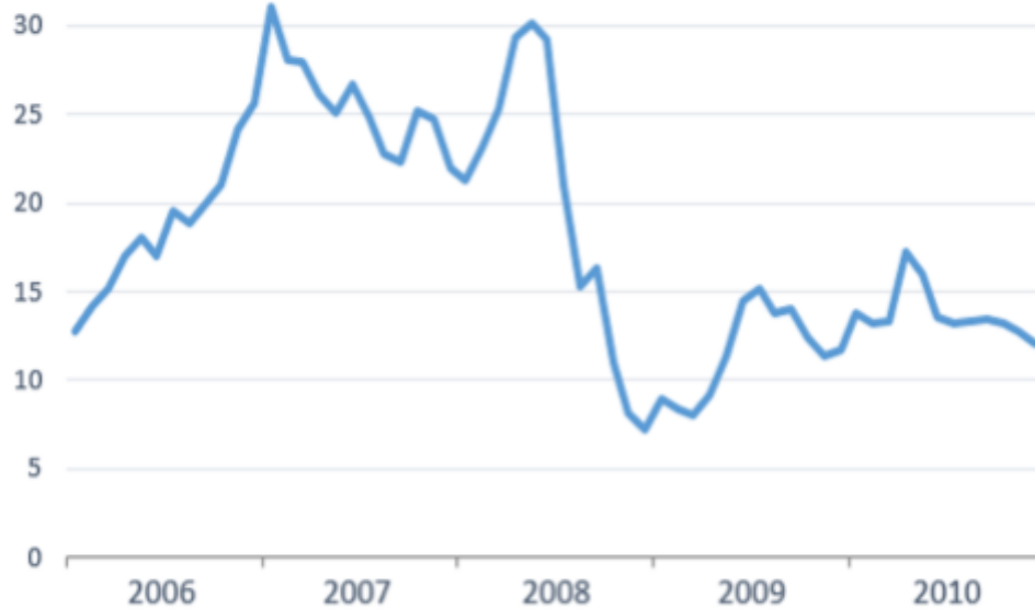
KPB Share price in USD

Here is a similar graph. The topic is slightly different, and so is the data. Write some sentences describing the different patterns on the graph, making sure you vary your sentence structures between the three examples we've looked at.