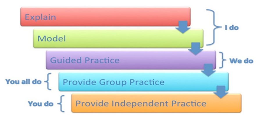
Figure 1. Gradual release model of teaching

background knowledge. Skills that are taught later in the year include inference making and comprehension monitoring and repair. This developmental approach is based on early research (Blank, Rose, & Berlin, 1978) that indicated that language develops from literal to inferential. Comprehension questioning can also be organized in this way so that easier types of comprehension skills are taught and mastered before inferential questions. In reality, it is likely that successful comprehension requires many strategies working in concert and that the development of these strategies is not linear. The goal of teaching the strategies in this particular order is to allow children to begin to develop more basic competencies, before moving on to more difficult and abstract strategies. When planning comprehension instruction, teachers should think about comprehension instruction as being cumulative; that is, new strategies build on and extend previous ones. It is likely that all students, even those who are not struggling readers, benefit from this type of explicit and systematic comprehension instruction. Therefore, we suggest that comprehension strategies be introduced in whole-class settings, with extended practice and direct instruction provided in small groups for students who are in need of supplemental Tier 2 instruction.