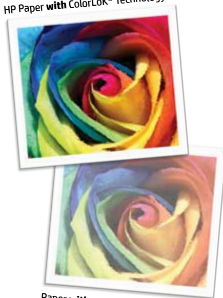
Paper without ColorLok® Technology