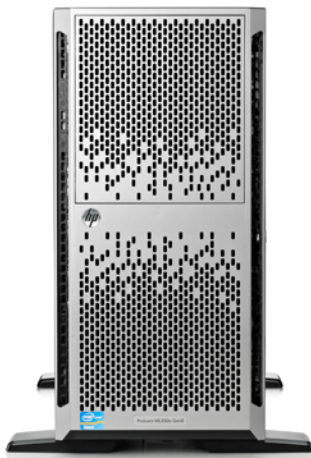
Figure 2. HP ProLiant Server portfolio

To help you find the Gen8 version of your current equipment, select the best server for your environment, and find the best fit for your organization's needs, please visit the HP ProLiant Gen8 transition guide at h20195.www2.hp.com/v2/GetPDF.aspx/4AA4-0119ENW.pdf .