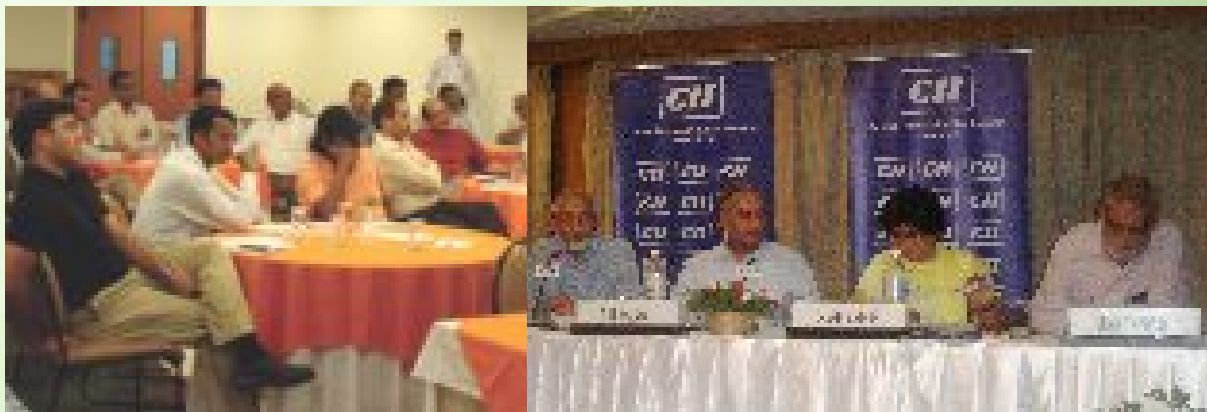
Membership meet at Parwanoo