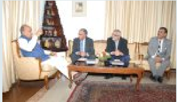
Chief Minister interacting with the CII delegation