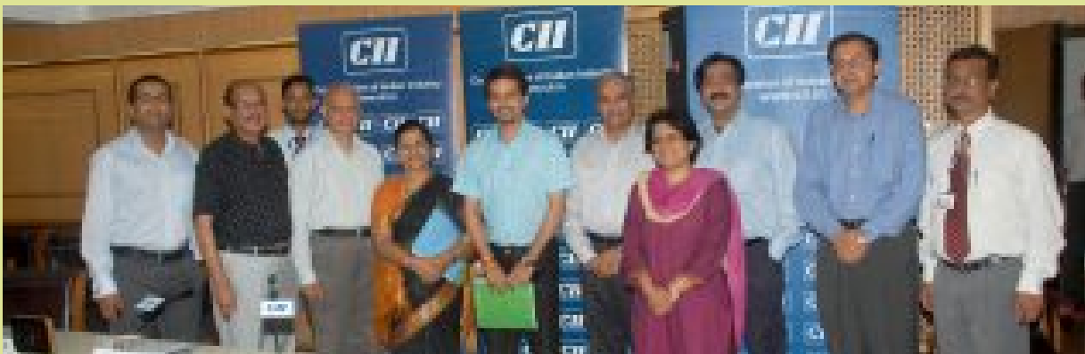
CII members with MPs from Himachal Pradesh

Mr Anurag Thakur, Member of Parliament (Lok Sabha) assured to take up the issues with the concerned departments and ministries and also assured full support to Confederation's initiatives for the state.