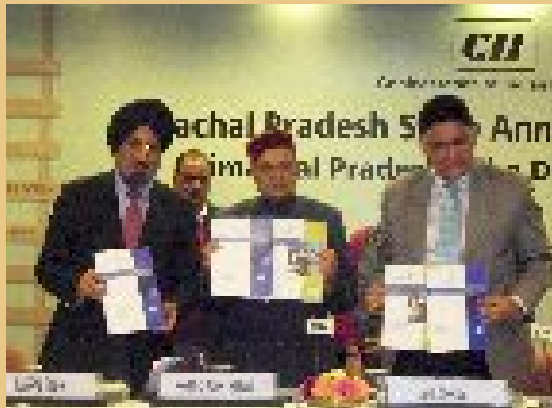
Prof Prem Kumar Dhumal releasing the study reports prepared by CII

At the Annual Session, the Chief Minister, Prof Prem Kumar Dhumal appreciated CII's support and consented to form a joint committee with CII. The key areas discussed were: