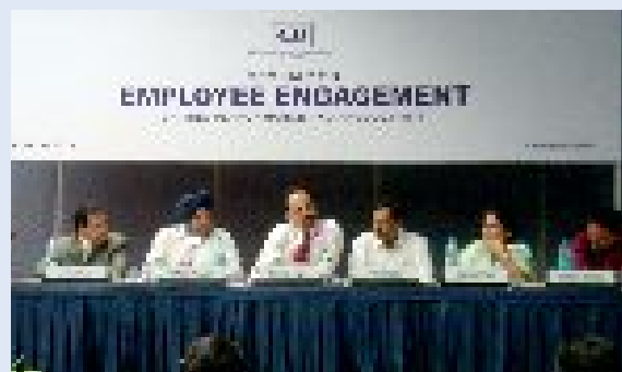
CII Seminar on Employee Engagement

The seminar was organized by CII Himachal Pradesh with the charter to promote employee engagement practices in industry to achieve excellence. Human Resource Management professionals from varied sectors shared their perspectives on the following subjects: