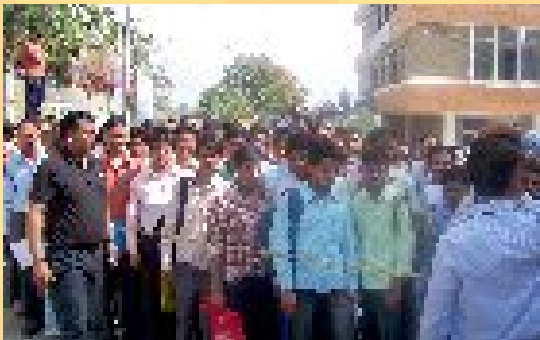
Candidates at Job Fair 2010, Hamirpur