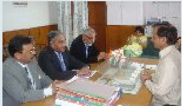
Mr Kishan Kapoor, Hon'ble Minister for Industries, HP interacting with CII delegation