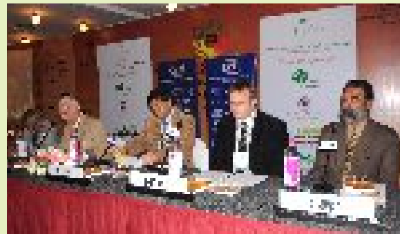
Apple Fest Conference