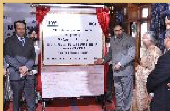
Mr Anand Sharma inaugurating the CII - IISD Skill Development Centre

CII Himachal Pradesh State has become the host of first of its kind Skill Development Centre in the northern part of the country. Mr Anand Sharma, Hon'ble Minister for Commerce & Industry, virtually inaugurated the centre.