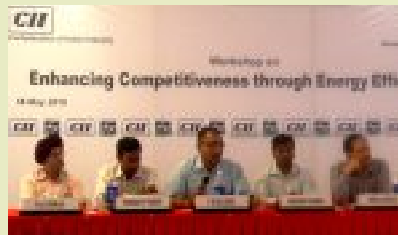
CII BEE Workshop in progress at Baddi

CII-BEE workshops were held at various industrial townships: