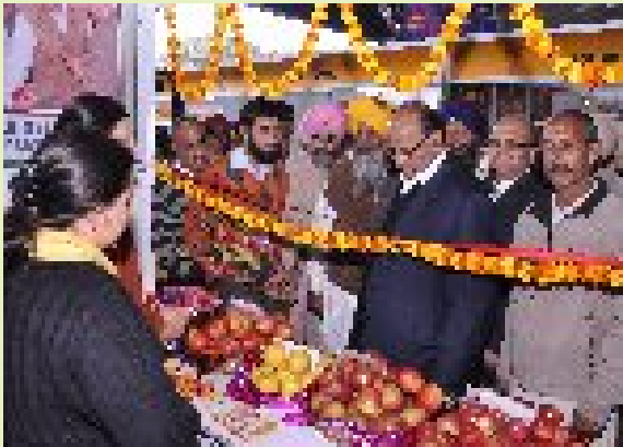
Sharad Pawar and Sucha Singh Langah at Apple Fest Exhibition

To attract maximum participation, Apple Fest 2010 was organized as a part of Agro Tech, which is India's Premier Biennial Agro Technology & Business Fair. This comprehensive event on apples, stone fruits and exotic vegetables produced in the hill states of North India provided an opportunity to the growers from Himachal, Uttarakhand and Jammu & Kashmir to display and sell their products and explore niche markets.