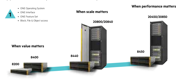
Figure 1: HPE 3PAR StoreServ Storage Models

With support for asynchronous streaming replication, you'll be able to dramatically reduce the cost and complexity of data protection with disaster recovery that can be set up and tested in only minutes and is supported across all models in the HPE 3PAR StoreServ Storage family (figure 1). HPE 3PAR StoreServ 20000 also supports flat backup to HPE StoreOnce Backup appliances for simple and efficient data protection that eliminates traditional backup processes.