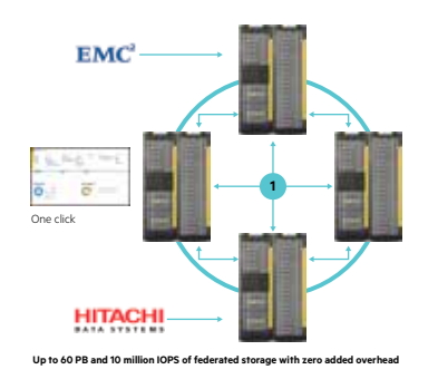
Figure 3: An elastic resource pool with one-click workload balancing

Another feature of the 3PAR OS, HPE 3PAR Thin Deduplication Software with patented Express Indexing delivers inline deduplication with hardware acceleration at scale. Thin Deduplication runs on any HPE 3PAR StoreServ array with an SSD tier to increase usable capacity, lower total cost of ownership, and extend flash media lifespan.