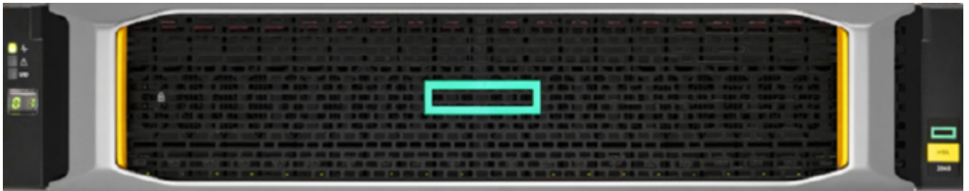
HPE MSA 2060 Storage

The HPE MSA 2060 is a flash-ready hybrid storage system designed to deliver hands-free, affordable application acceleration for small and remote office deployments. Don't let the low cost fool you. It gives you the combination of simplicity, flexibility, and advanced features you may not expect in an entry-priced array. Start small and scale as needed with any combination of solid state drives (SSDs), high-performance Enterprise SAS HDDs, or lower-cost Midline SAS HDDs. With the ability to deliver 325,000 IOPS, the new MSA 2060 is up to 45% faster than its prior generation with ample horsepower for even the most demanding workloads.