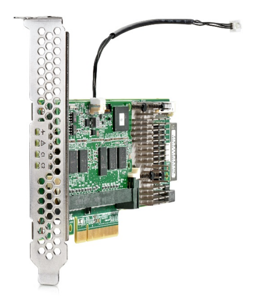
HPE Smart Array P440 Controller

The Gen9 family of controllers supports the HPE Smart Storage Battery. With HPE Smart Storage Battery, multiple Smart Array controllers are supported without needing additional backup power sources for each controller, resulting in simple upgrade process.