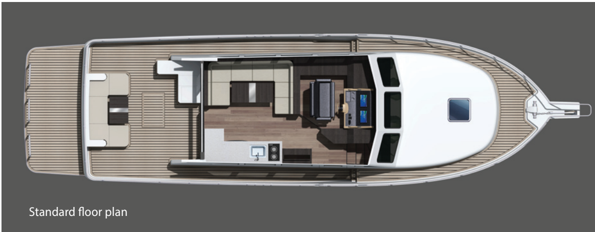
Standard floor plan