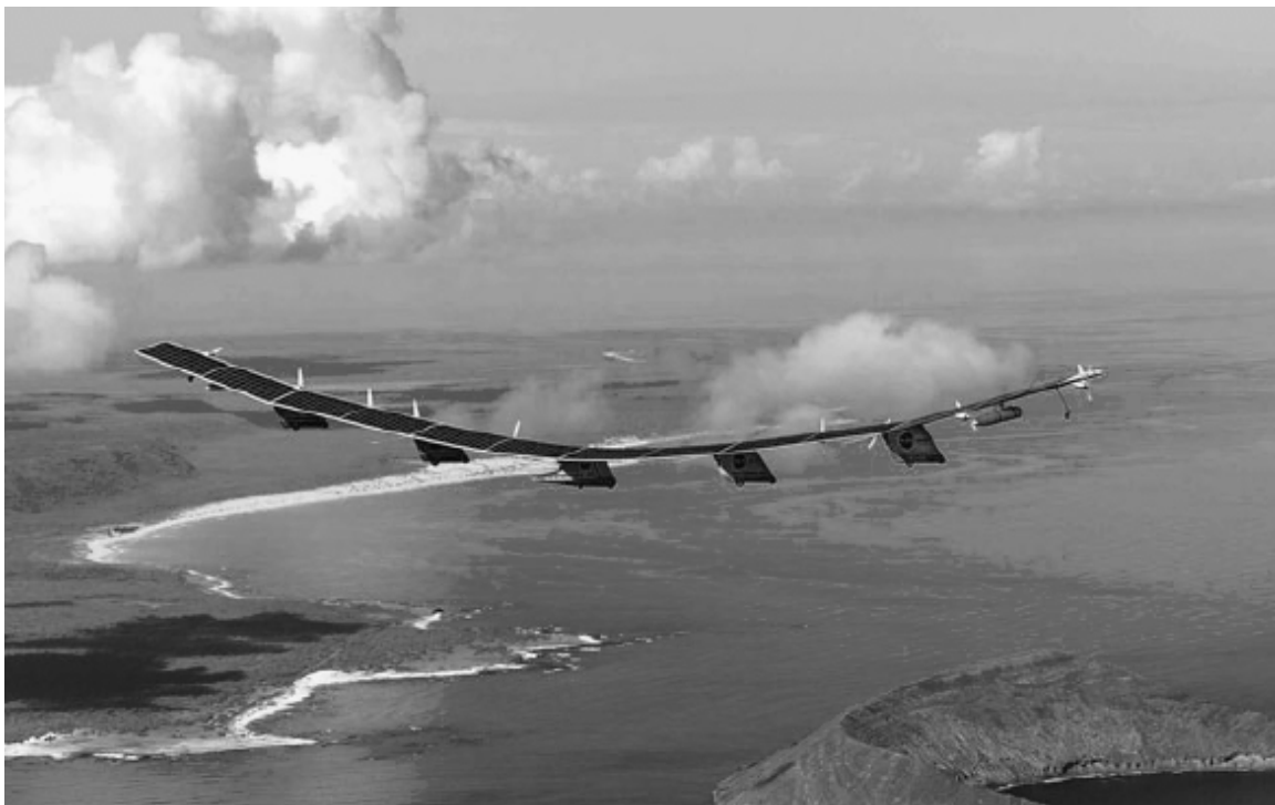
Figure 2: Helios UA.

A more recent crash was that of a Helios UA in June 2003. The Helios (Figure 2) is intended to fly for extended lengths of time at very high altitudes. During a flight test of the Helios in June 2003, the aircraft flew into turbulence that exceeded the maximum capability of