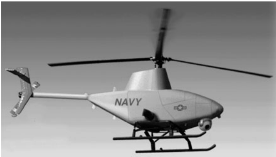
Figure 3. The U.S. Navy Fire Scout (RQ-8A).

The investigation of the accident, which occurred on November 4, 2000, revealed that human error associated with damage to onboard antennas during ground handling led to the accident. Because of the damage to the antennas, an incorrect signal was emitted, causing the